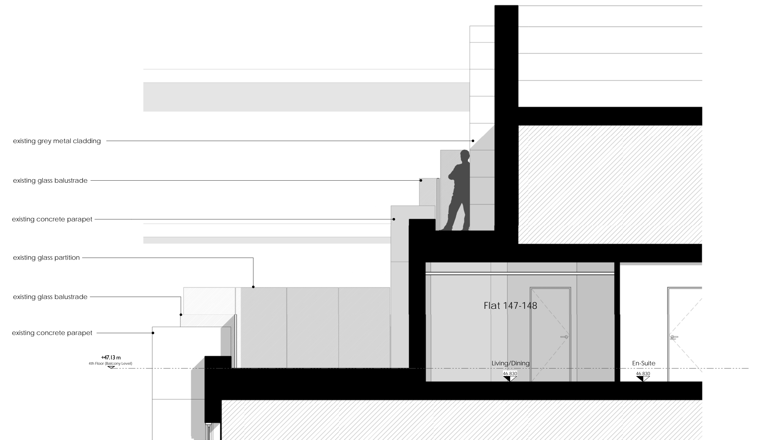
3 Existing Section 3A (West) 1 : 50