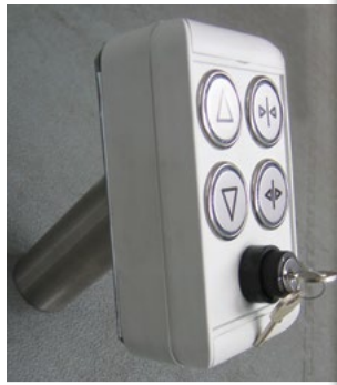
Optional rail-mounted push unit

The unit is suitable for both indoor and outdoor use and can be stanchion mounted, if walls adjacent to the stairs are not load-bearing.