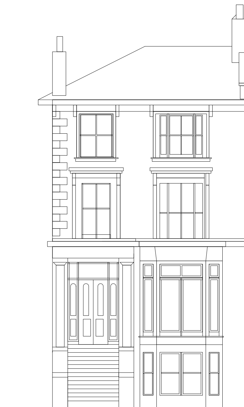
1 Front Elevation