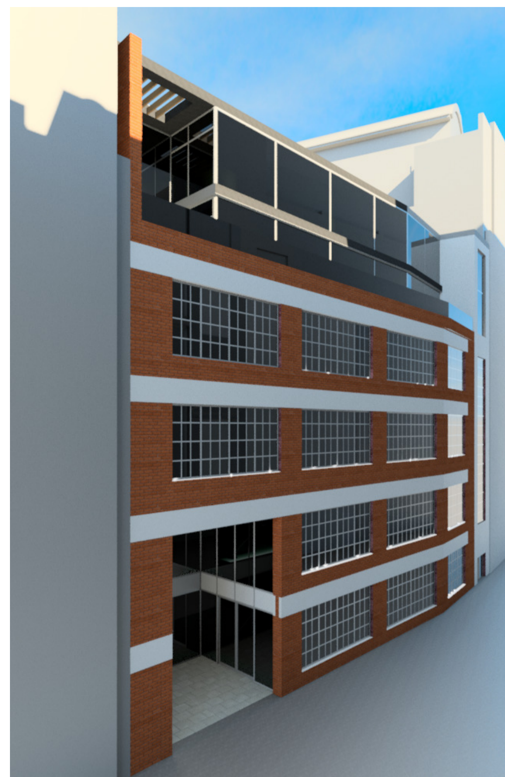
Street View from Back Hill