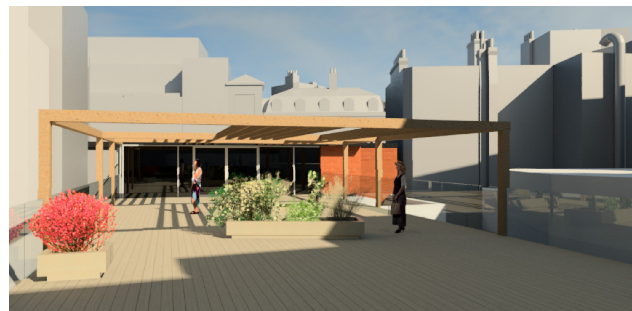
View from Roof Terrace looking at building