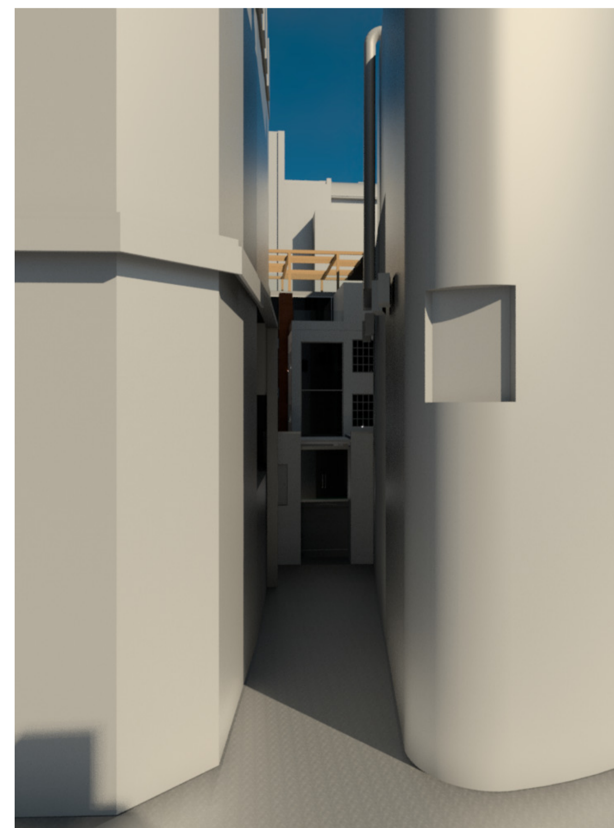
Proposed View from Clerkenwell Road