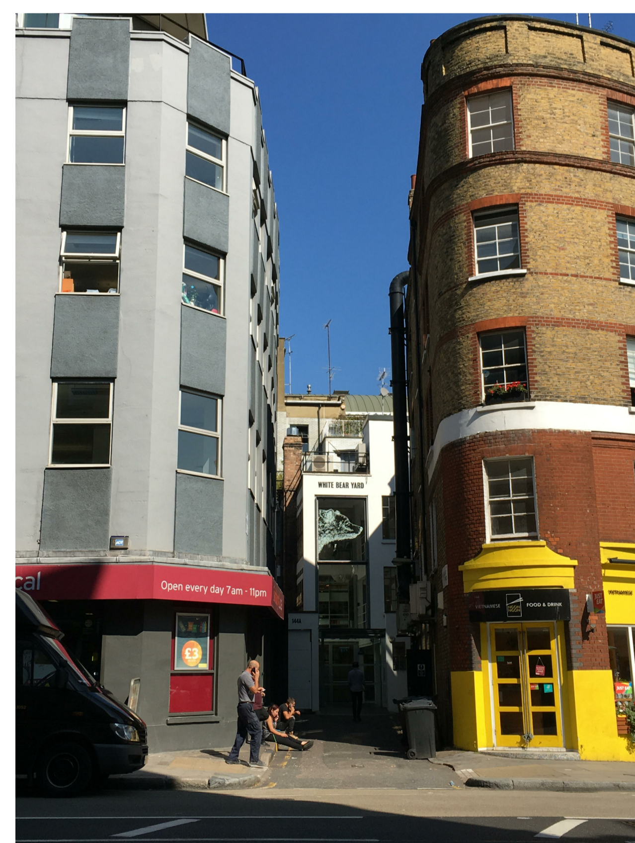
Existing View from Clerkenwell Road