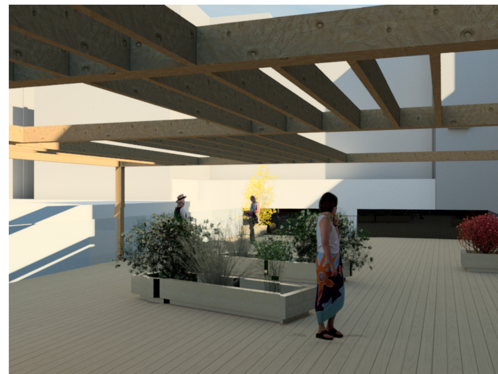
View looking away from building on Roof Terrace