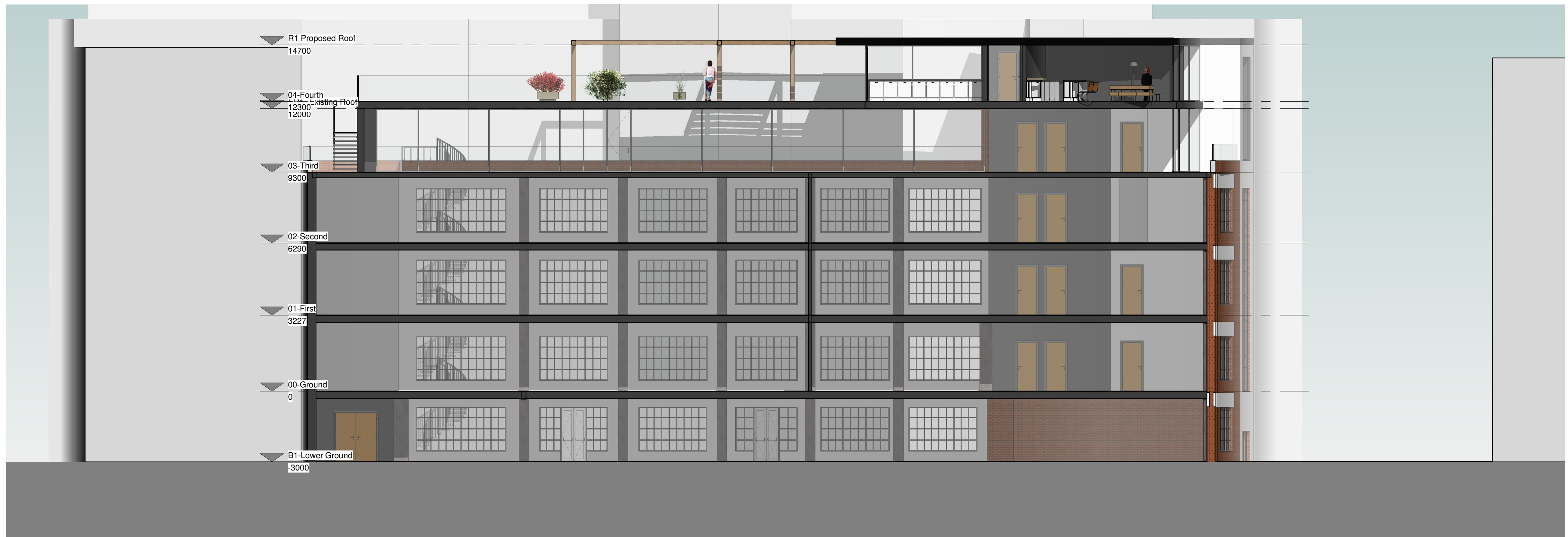
1 Section 2 1 : 100