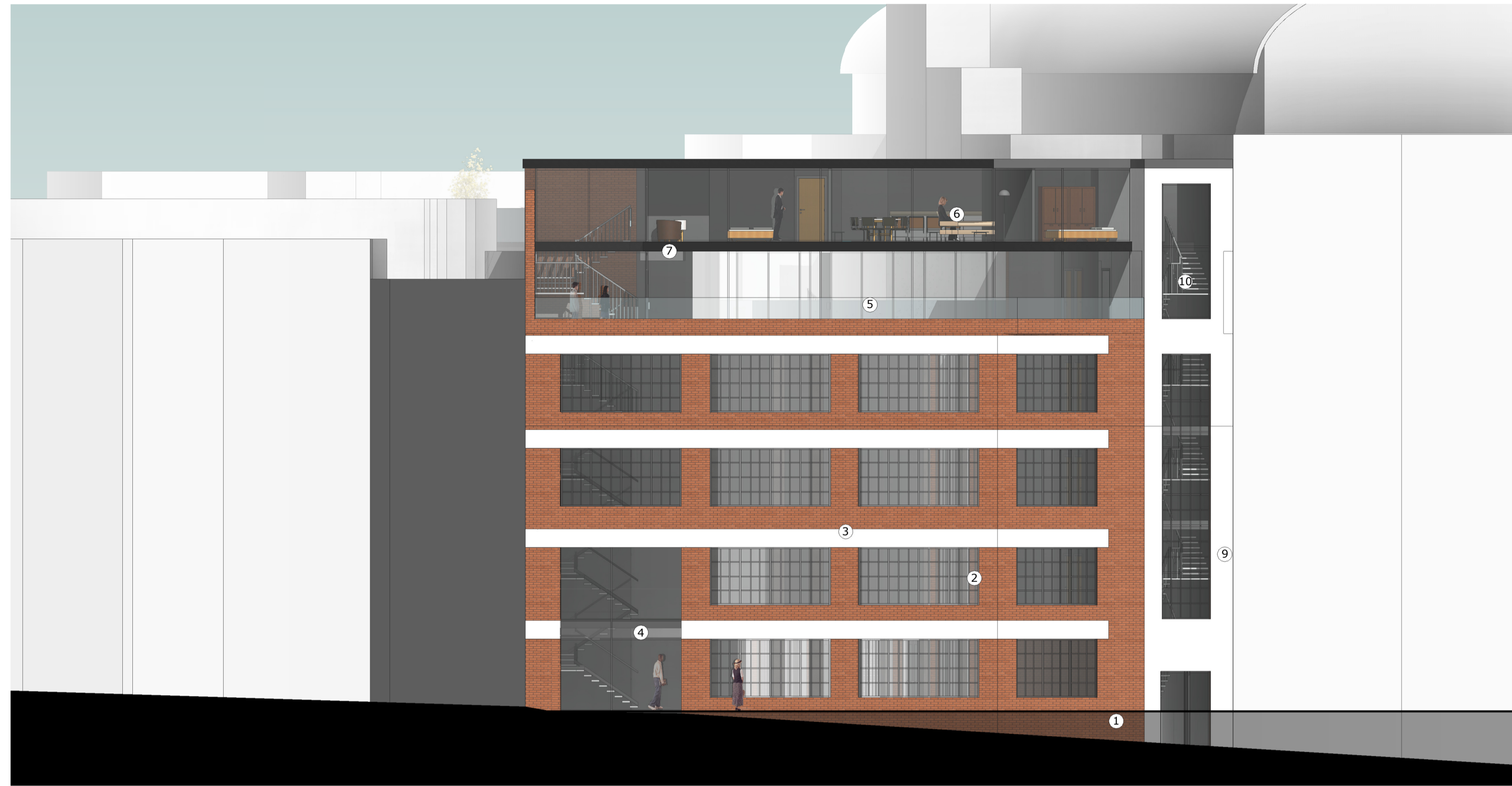
1 Proposed East Elevation 1 : 100