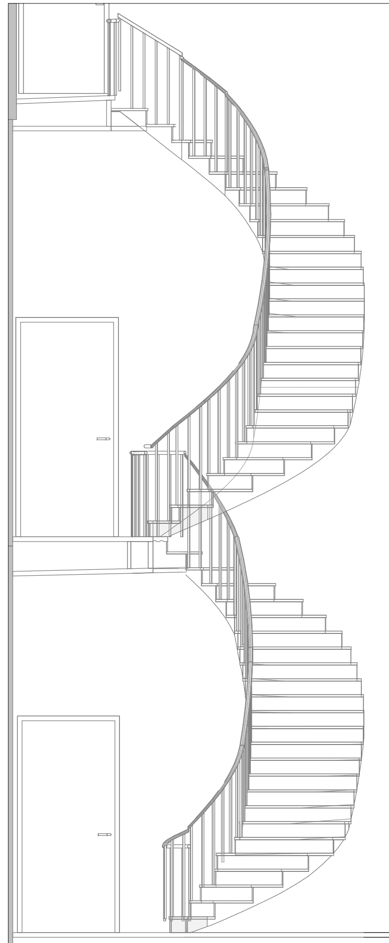
2 Section 1.8.2