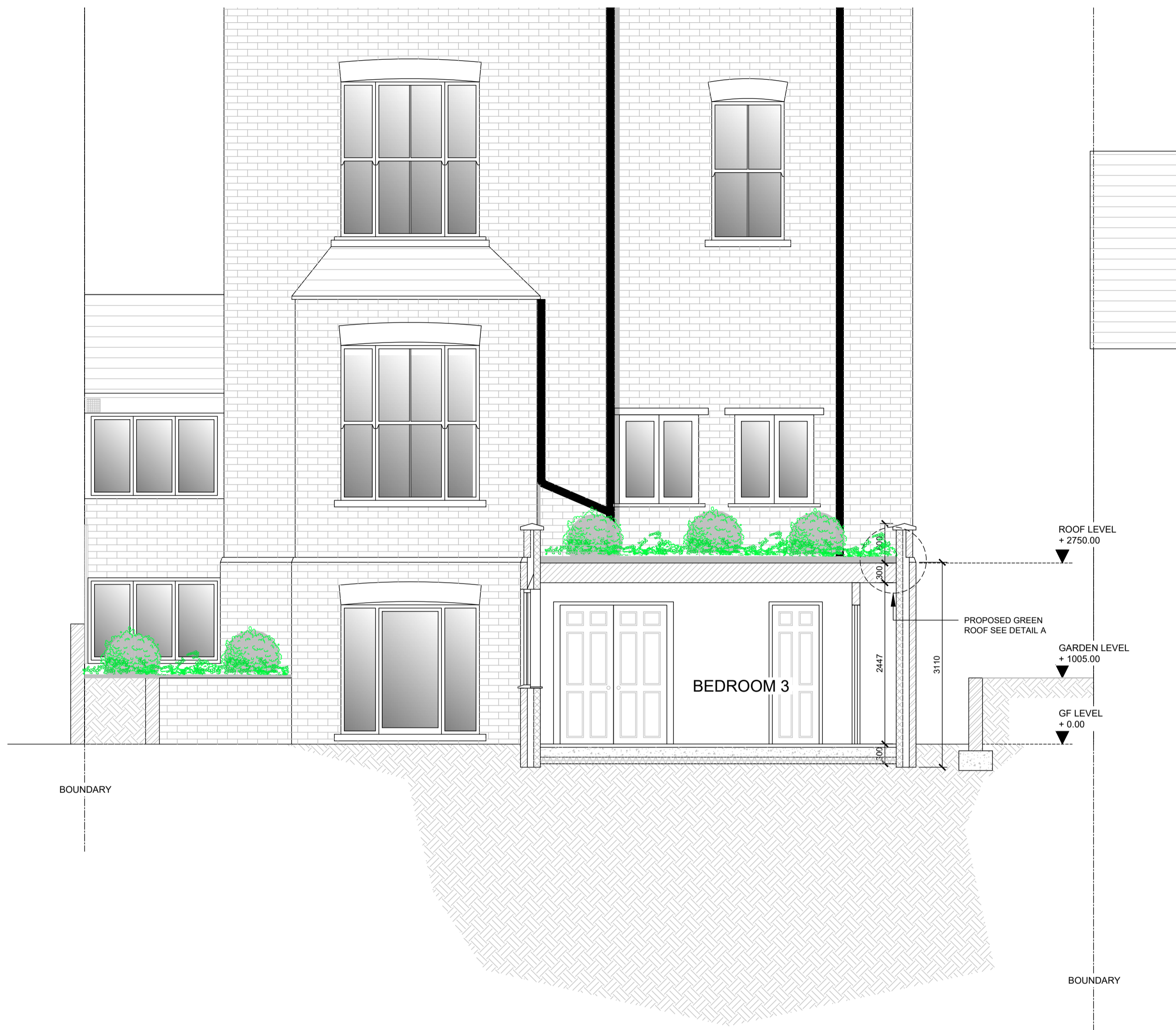
SECTION A-A SCALE 1:50