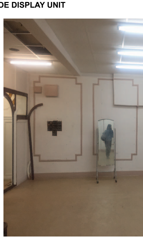
E - VIEW OF SHOP INTERIOR