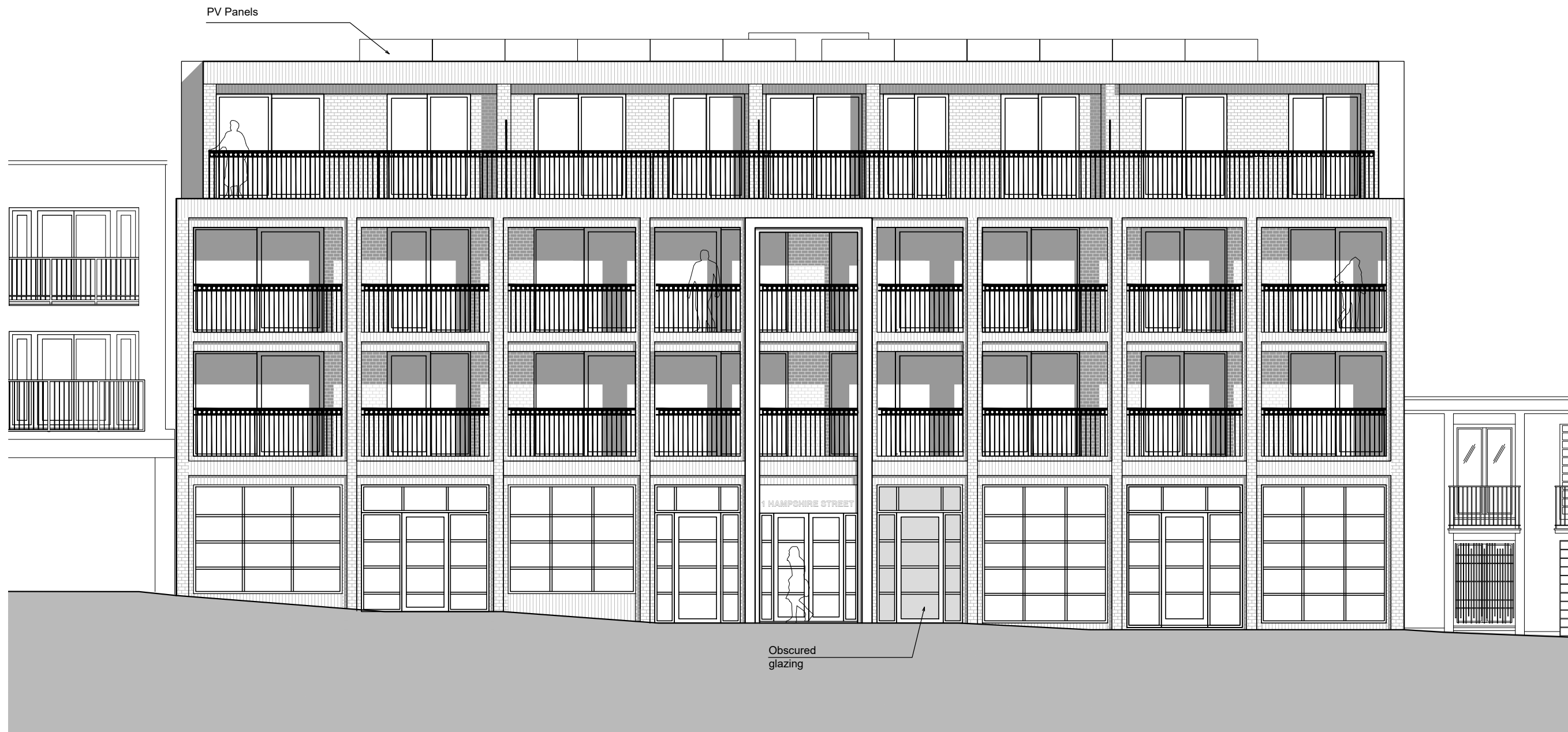
PROPOSED ELEVATION SCALE 1:100