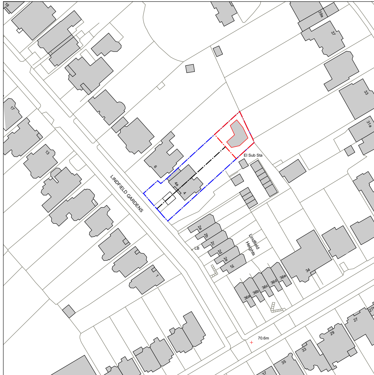
PROPOSED SITE LOCATION PLAN