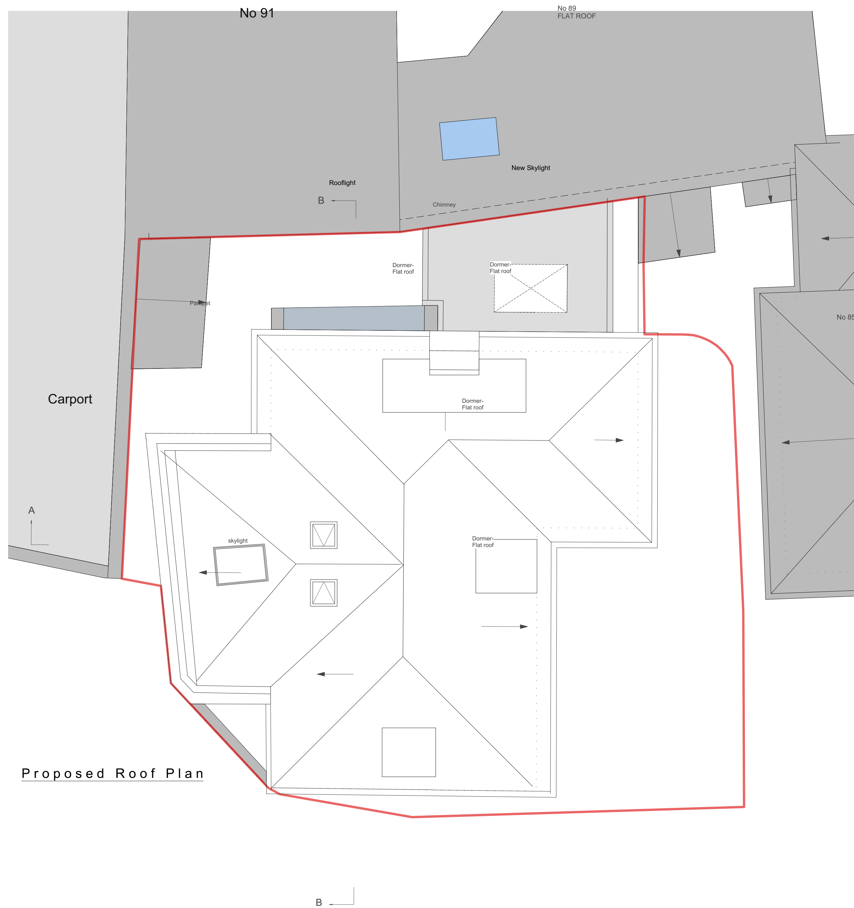
Proposed Roof Plan