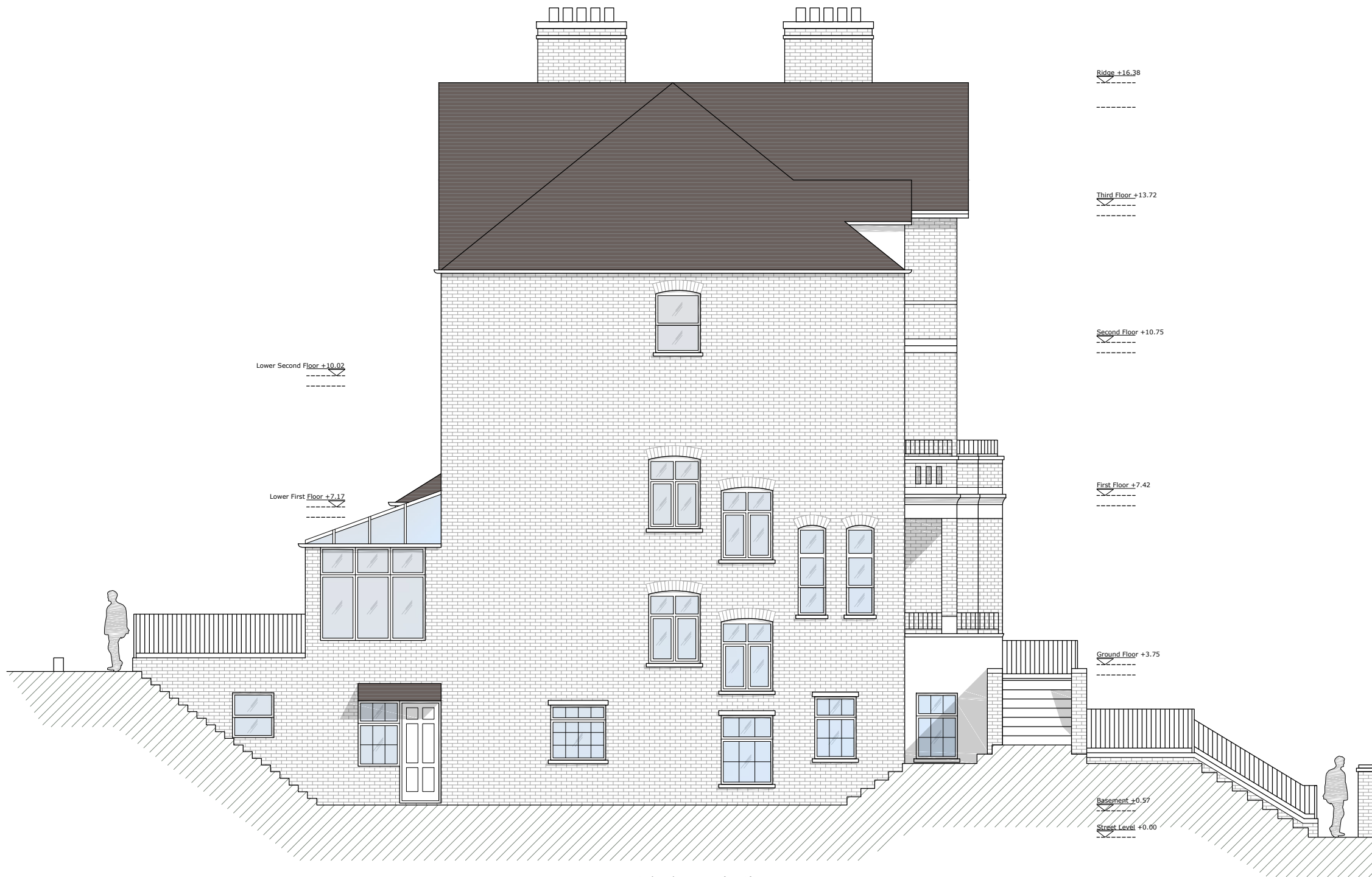
Existing Side Elevation (LHS)