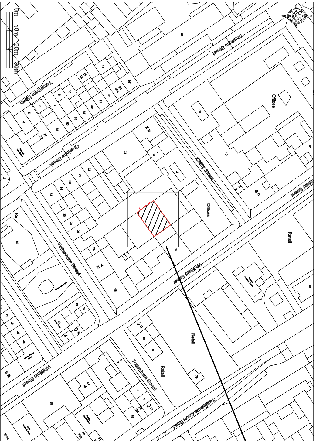
Site Plan Scale 1:1250