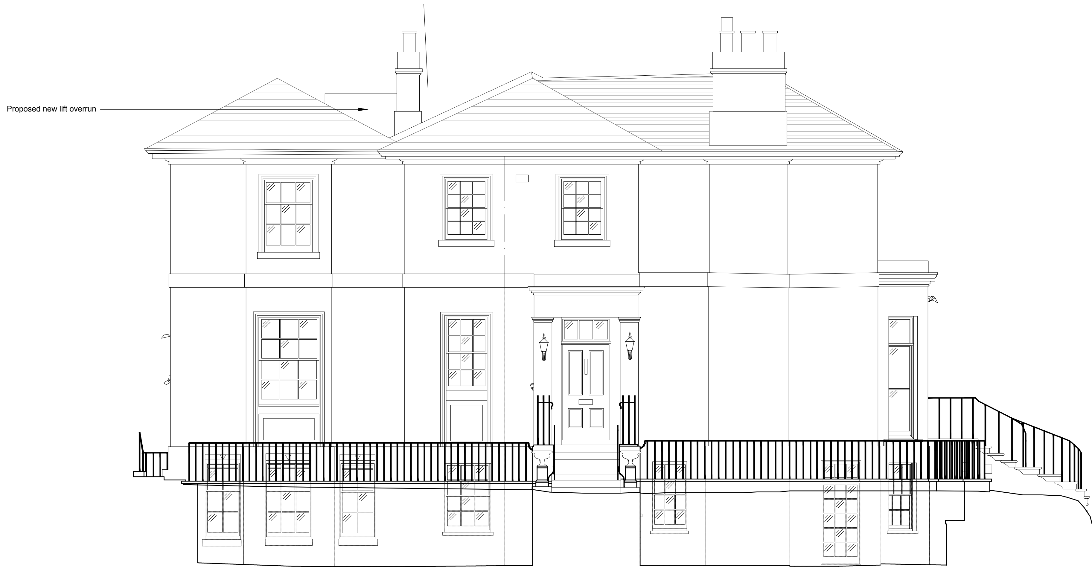
1 As Proposed: E3 - South West Elevation - 03 211 1:50@A1, 1:100@A3