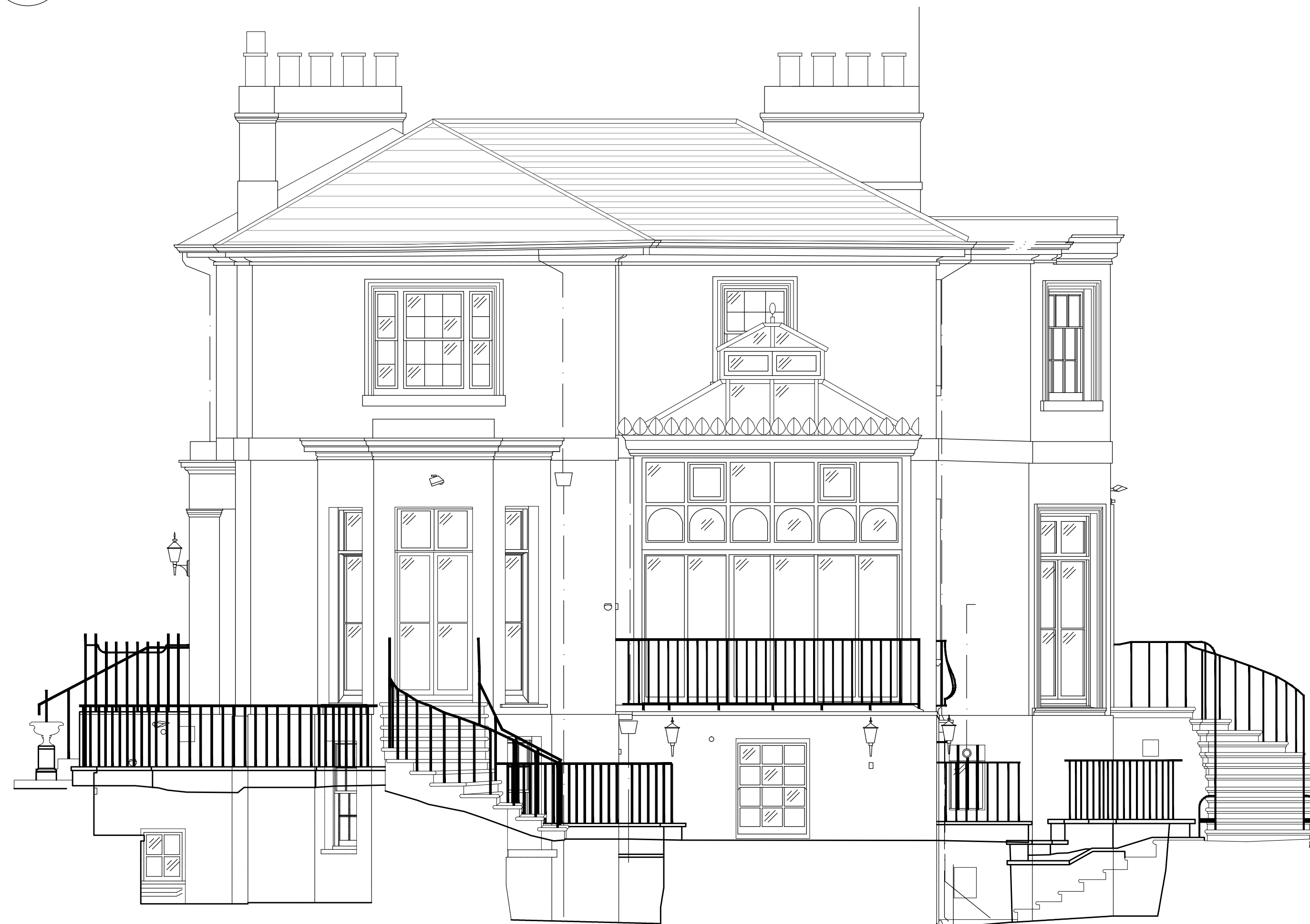
2 As Proposed: E4 - South East Elevation - 04 211 1:50@A1, 1:100@A3