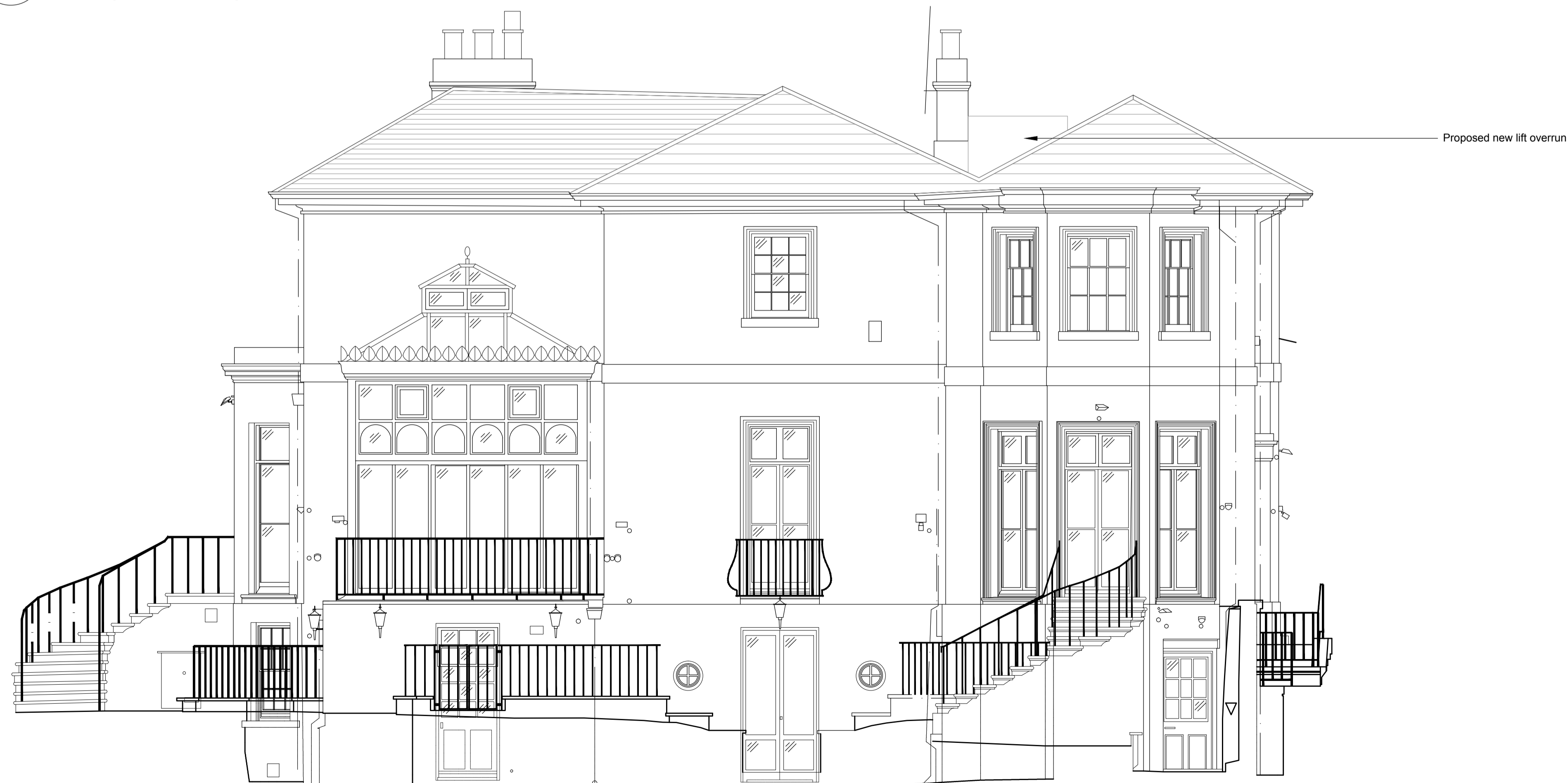
2 As Proposed: E2 - North East Elevation - 02 210 1:50@A1, 1:100@A3

Notes: Drawings are based on survey data and may not accurately represent what is physically present. Do not scale from this drawing. All dimensions are to be verified on site before proceeding with the work. All dimensions are in millimeters unless noted otherwise. Purcell shall be notified in writing of any discrepancies.