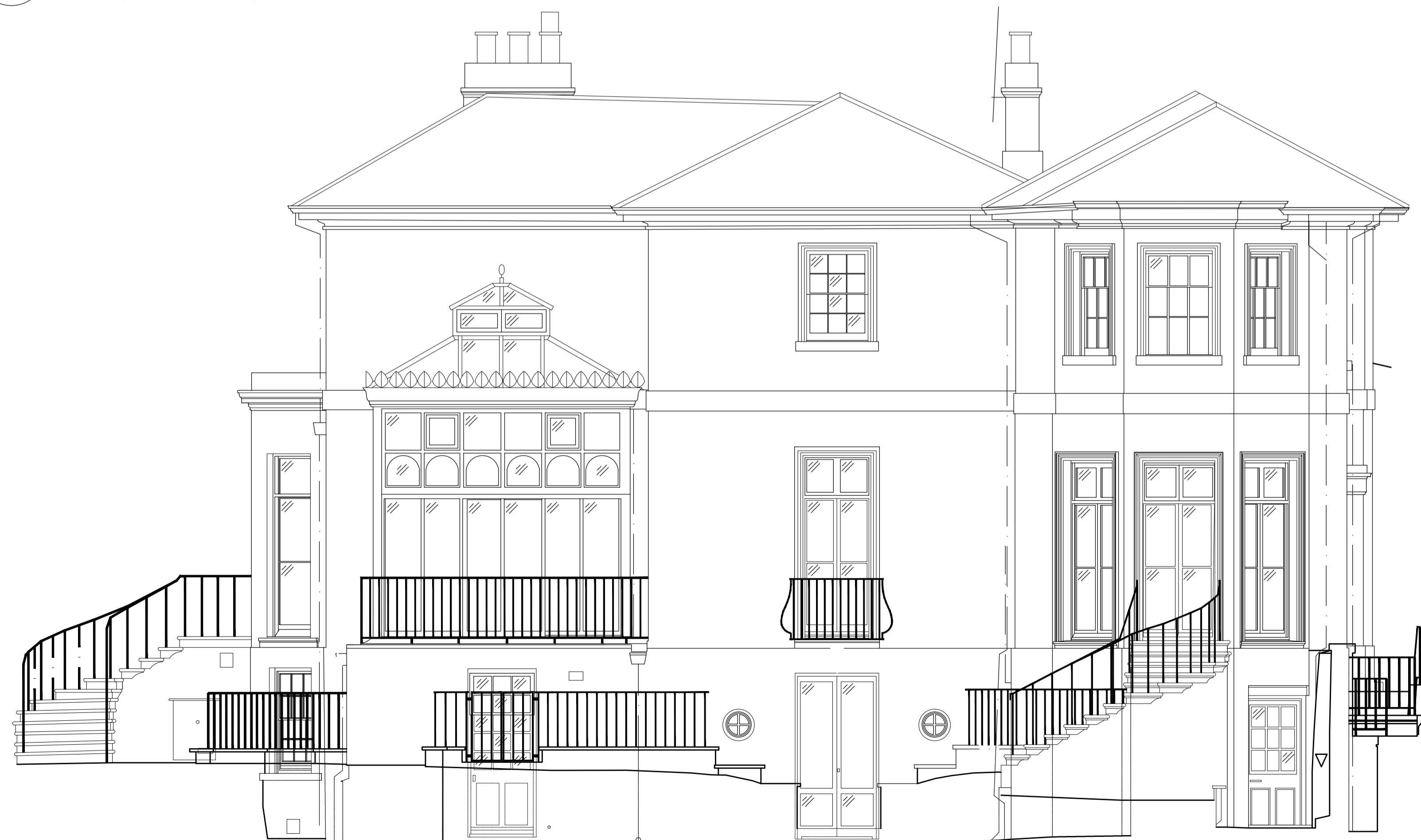
2 As Existing: E2 - North East Elevation 02 110 1:50@A1, 1:100@A3

Notes: Drawings are based on survey data and may not accurately represent what is physically present. Do not scale from this drawing. All dimensions are to be verified on site before proceeding with the work. All dimensions are in millimeters unless noted otherwise. Purcell shall be notified in writing of any discrepancies.