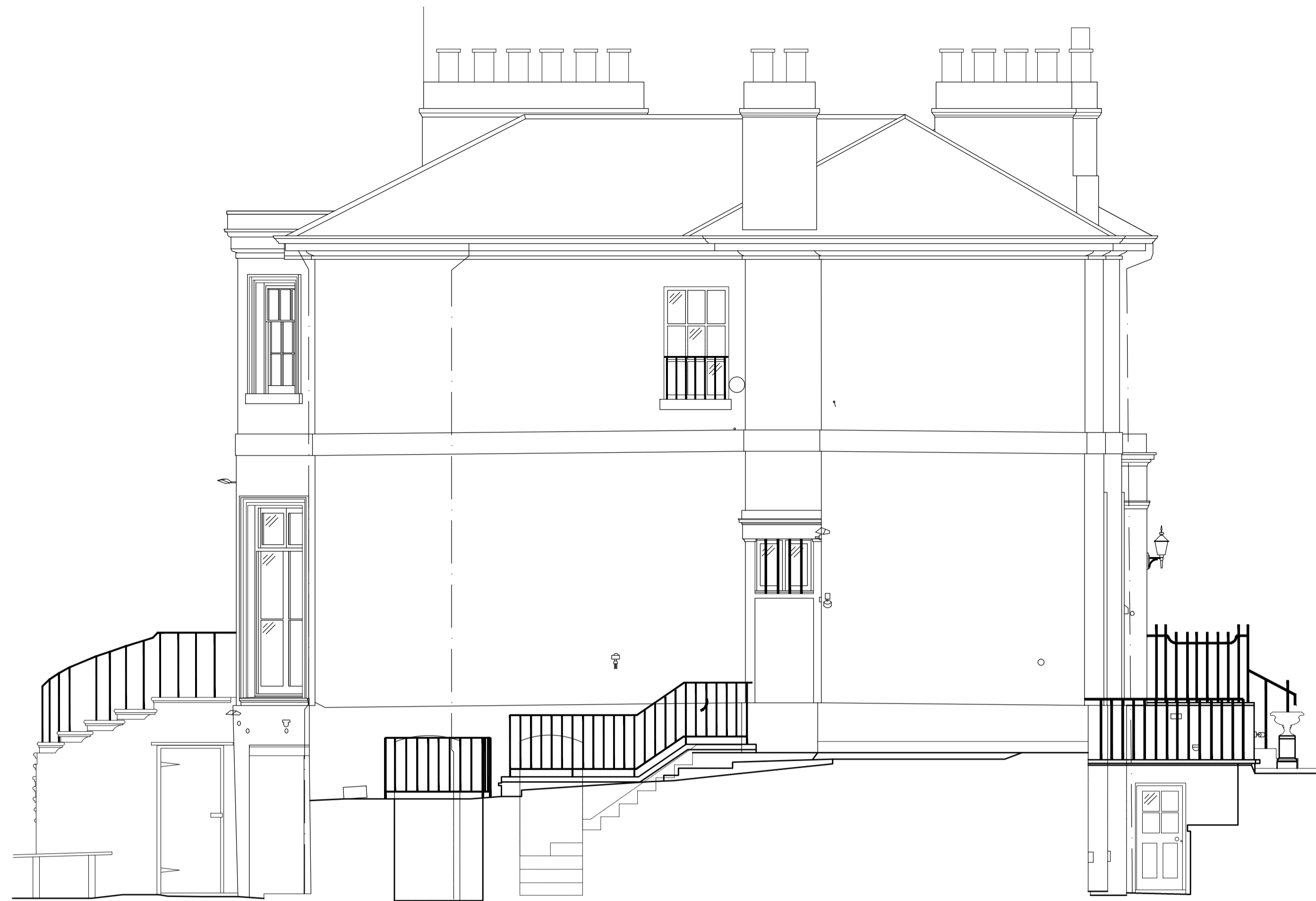
1 As Existing: E1 - North West Elevation 01 110 1:50@A1, 1:100@A3