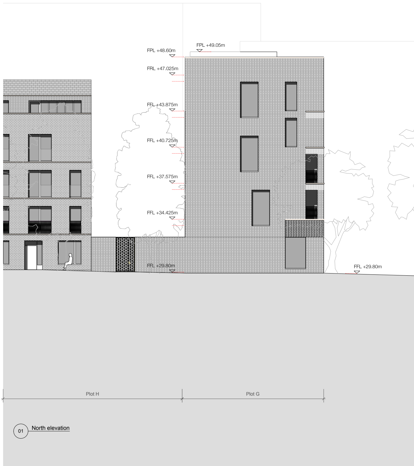
01 North elevation