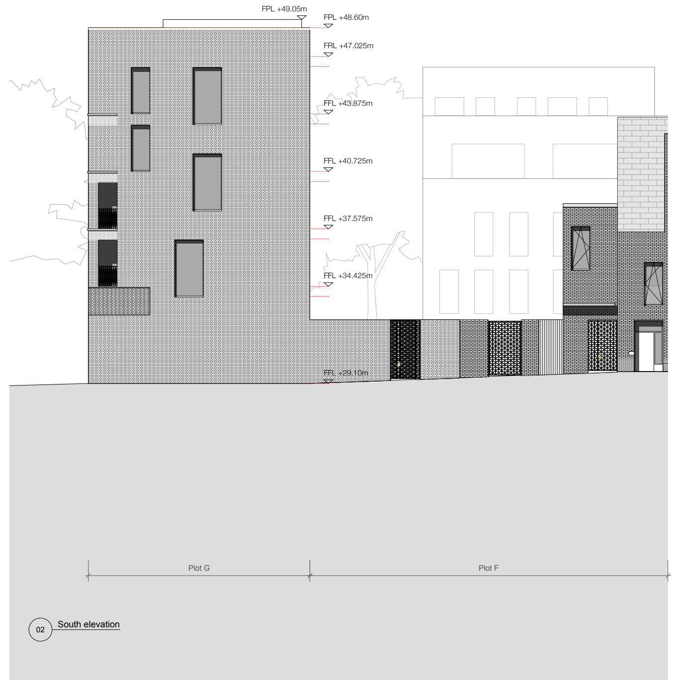
02 South elevation

NOTES: 1. Measurements are based on metric system 2. All levels are in meters to Principal Datum (PD) unless noted otherwise 3. Do not scale drawing 4. Figure dimensions are to be followed 5. Do not use for construction unless expressly permitted 6. Contractor should verify all conditions on site and notify contract administrator of any variations from dimensions before construction 7. Internal furniture is indicative only The data contained in this document includes proprietary rights of mae. Any party in receipt of the document shall receive and hold the same in confidence and agrees not to duplicate or otherwise reproduce the document in whole or in part, nor disclose the contents of the same without the written consent of mae.