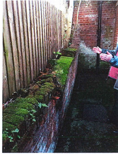
T2 & T3