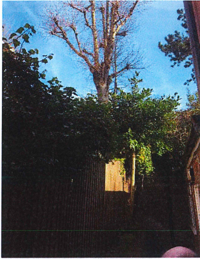
T1 (Large tree to rear)