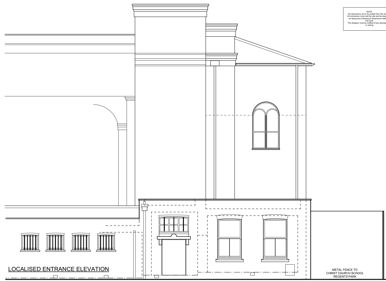
LOCALISED ENTRANCE ELEVATION

NOTE: No dimensions are to be scaled from this drawing. All contractors must visit the site and be responsible for taking and checking all dimensions relative to this work. The designer must be notified of any discrepancies in writing.