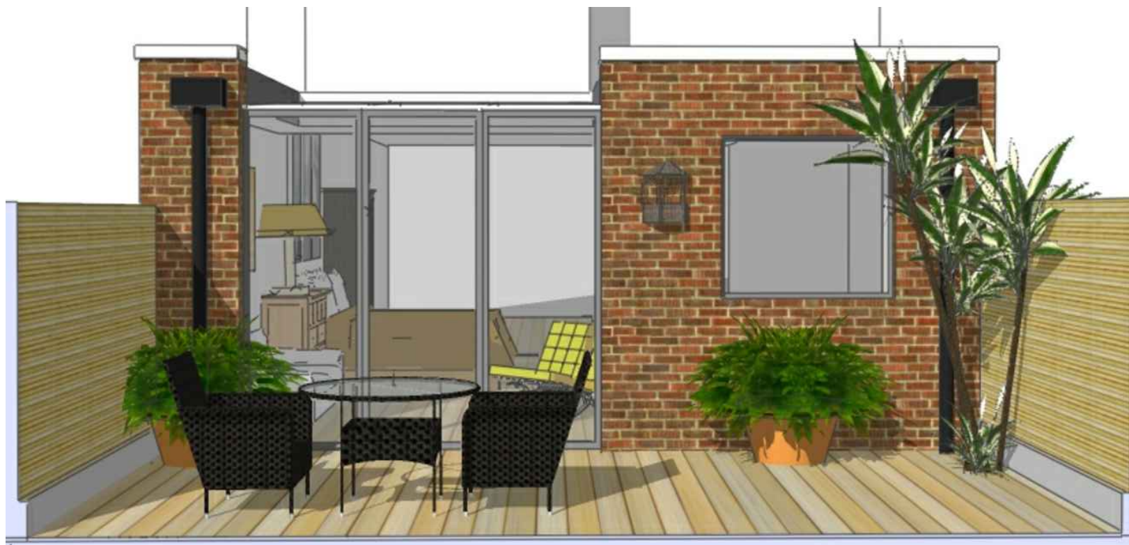
BRICKS TO MATCH EXISTING