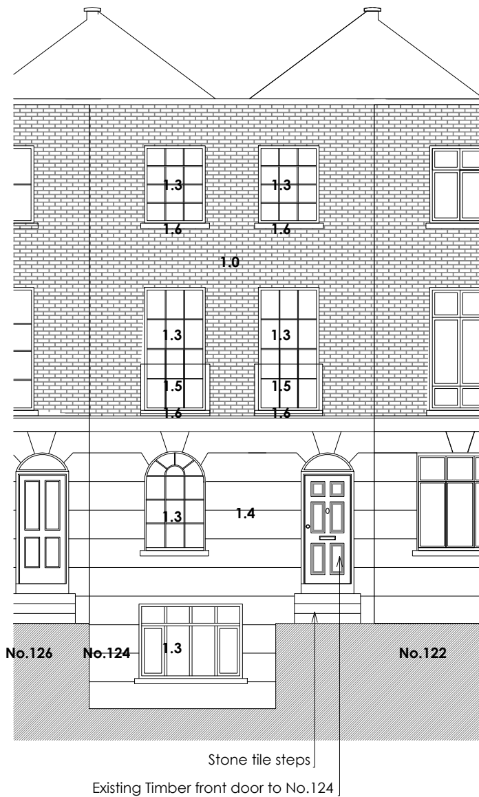
01 Front No work proposed to the front elevation