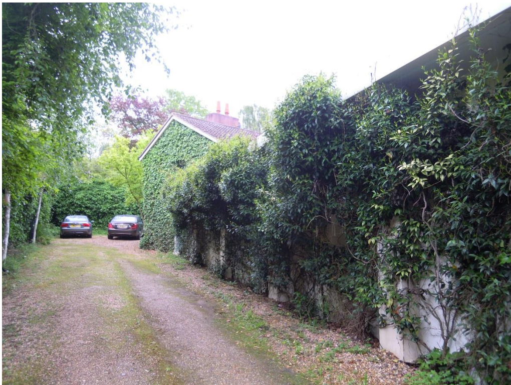
8. Front drive adjoining pool wing