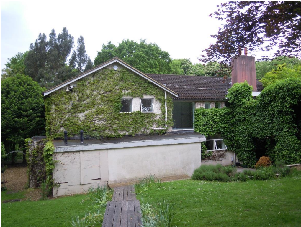
7. Rear of house