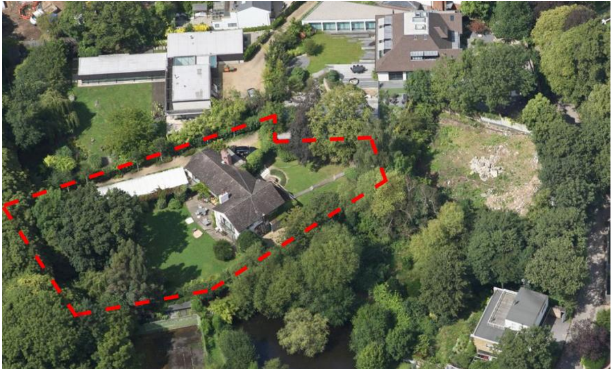
1. Aerial view northwards showing Water House, Wallace House to north and 49 Fitzroy Park to NW