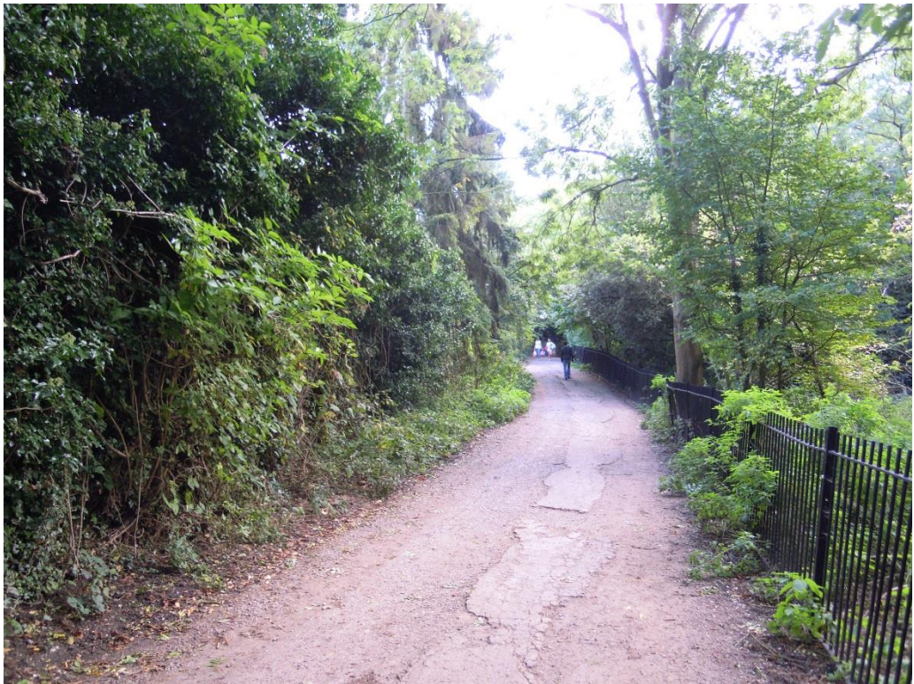
4. View further south along lane