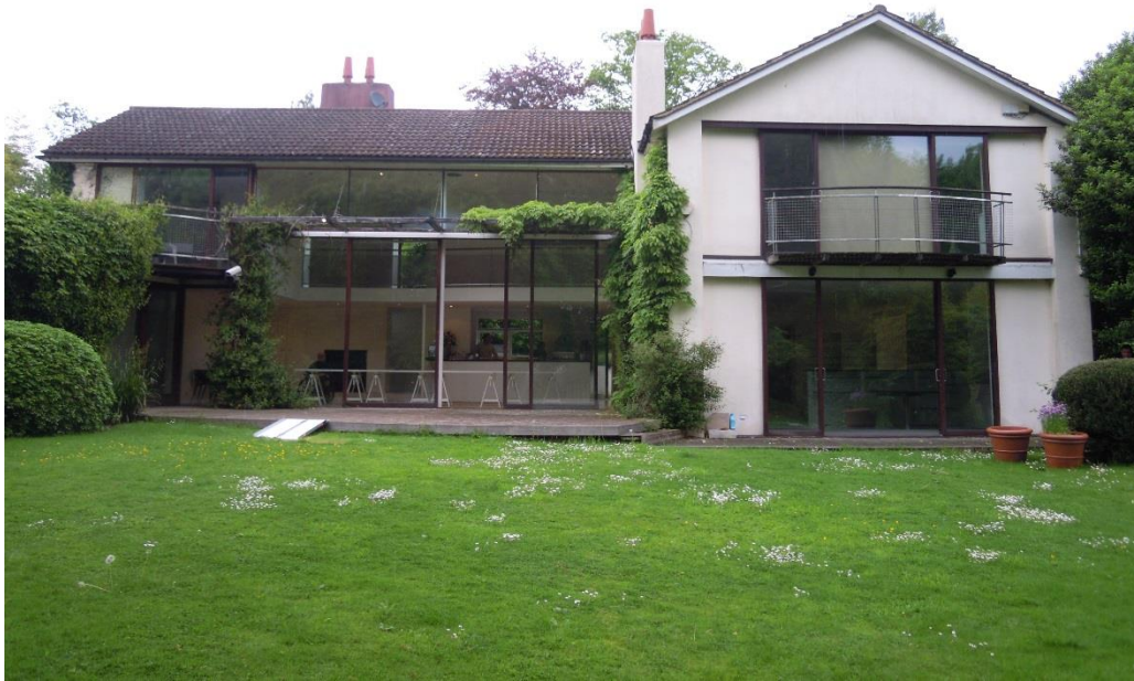
5. Front of house