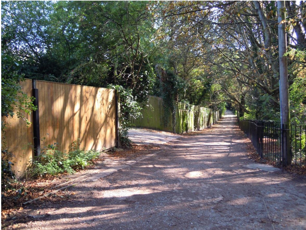
3. View southwards along Millfield Lane showing entrances to site (left) and Ladies Pond (right)