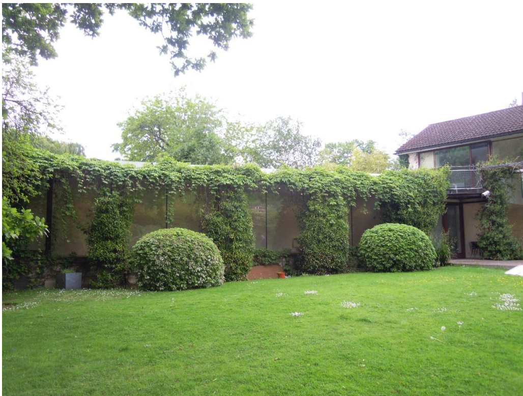
6. Front pool wing