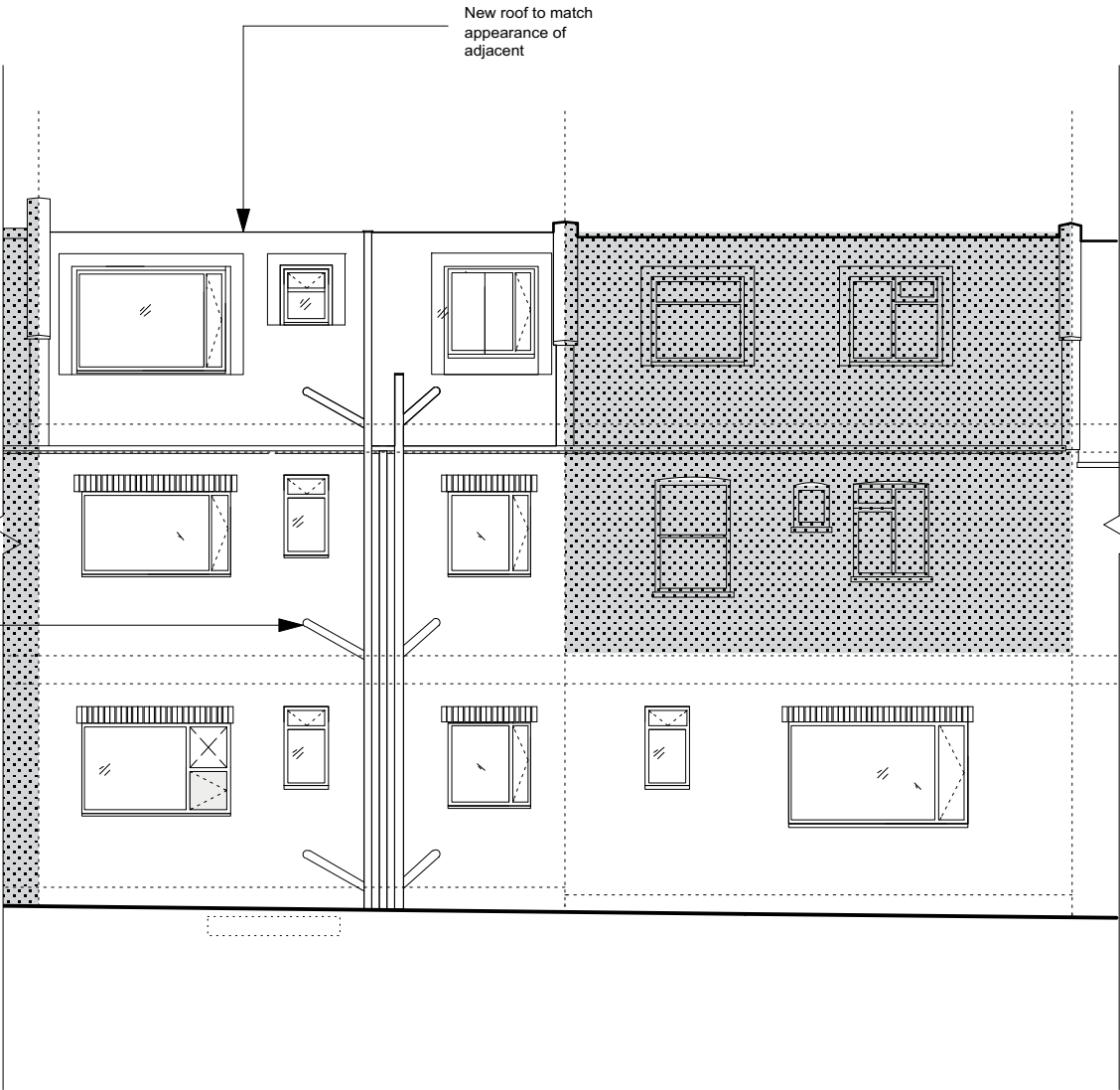
Proposed Rear Elevation 1:100