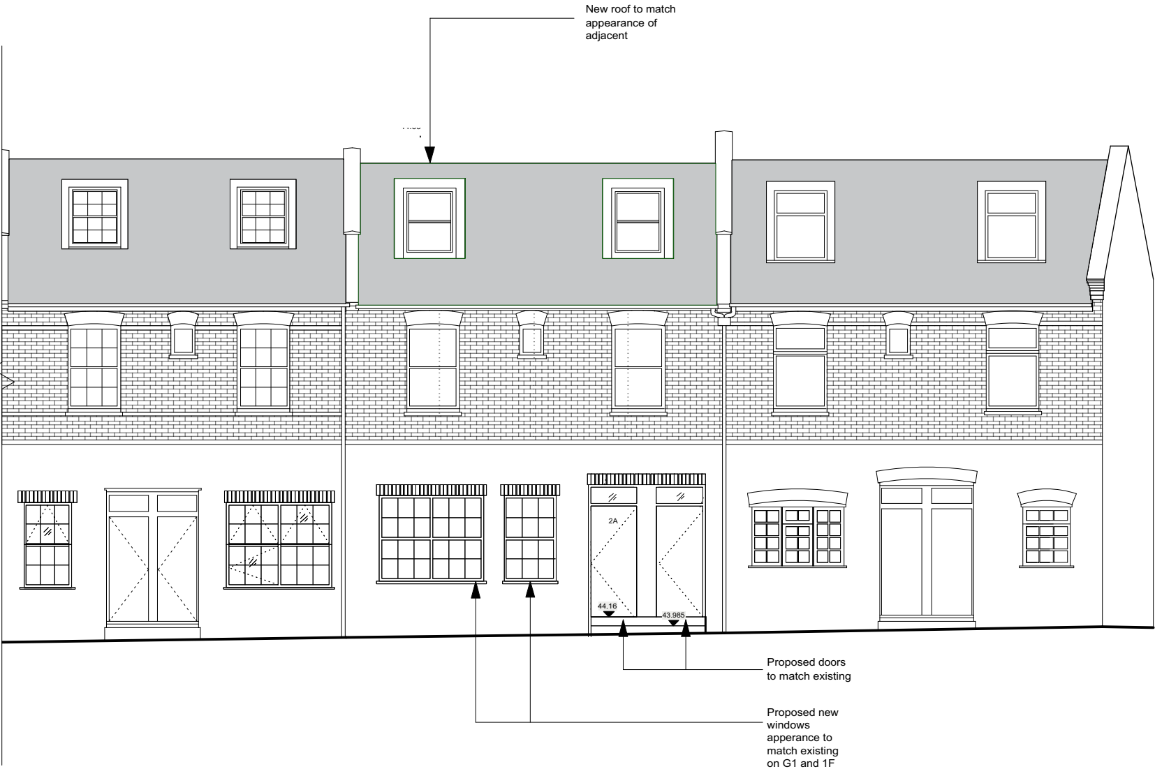
Proposed Front Elevation 1:100