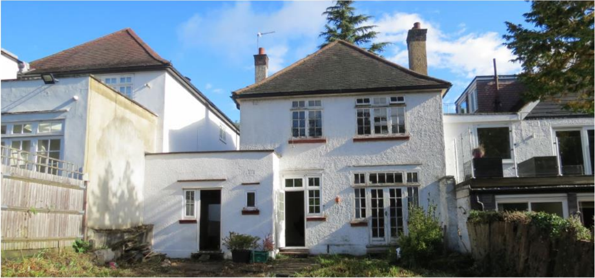
Image 1. Existing rear elevation looking east