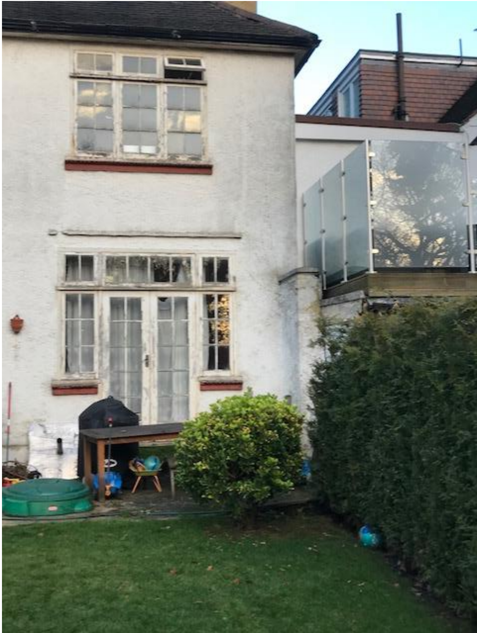
Image 4, rear southeast elevation