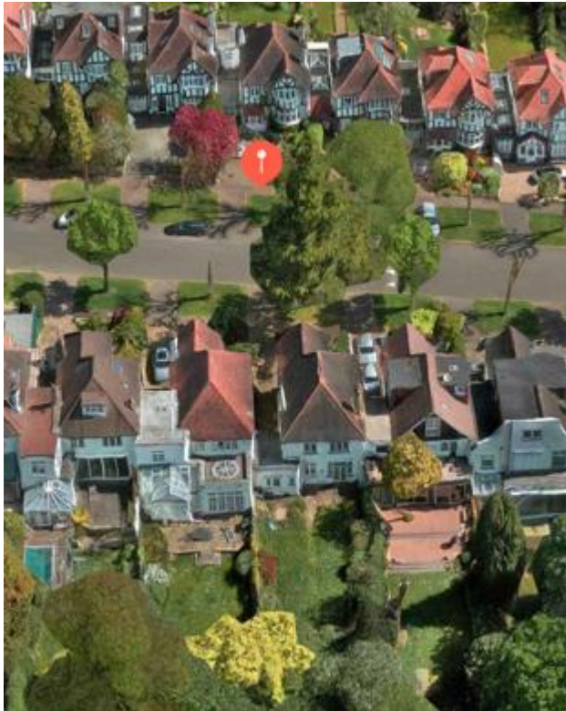
Image 6. Aerial view of the rear