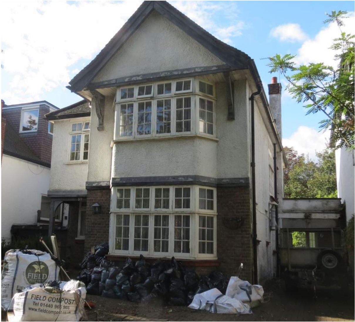
Image 8, Existing front elevation