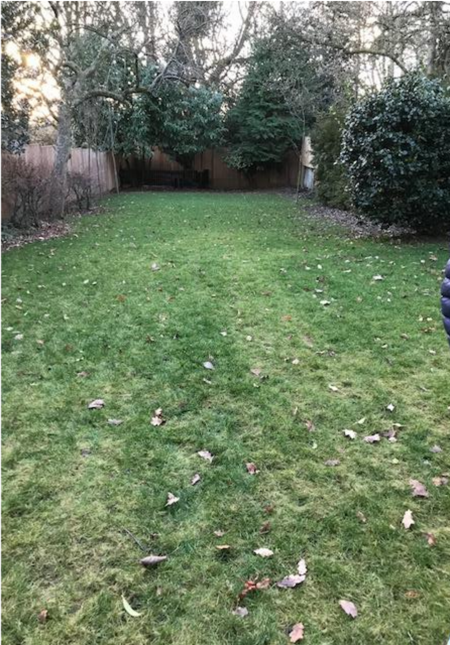
Image 5. Rear elevation facing west