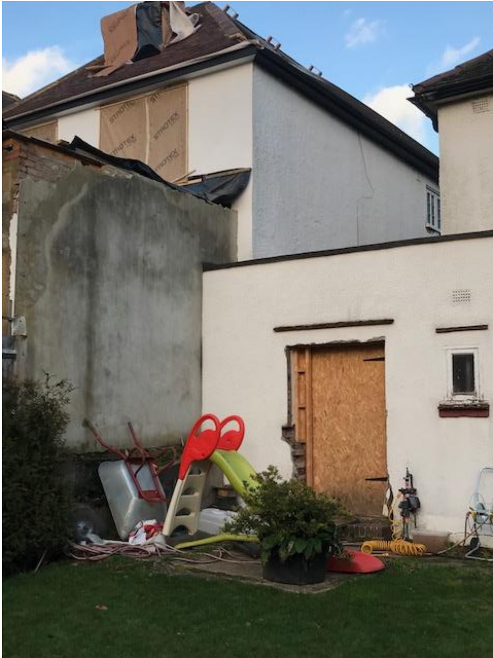
Image 3. Rear northeast elevation