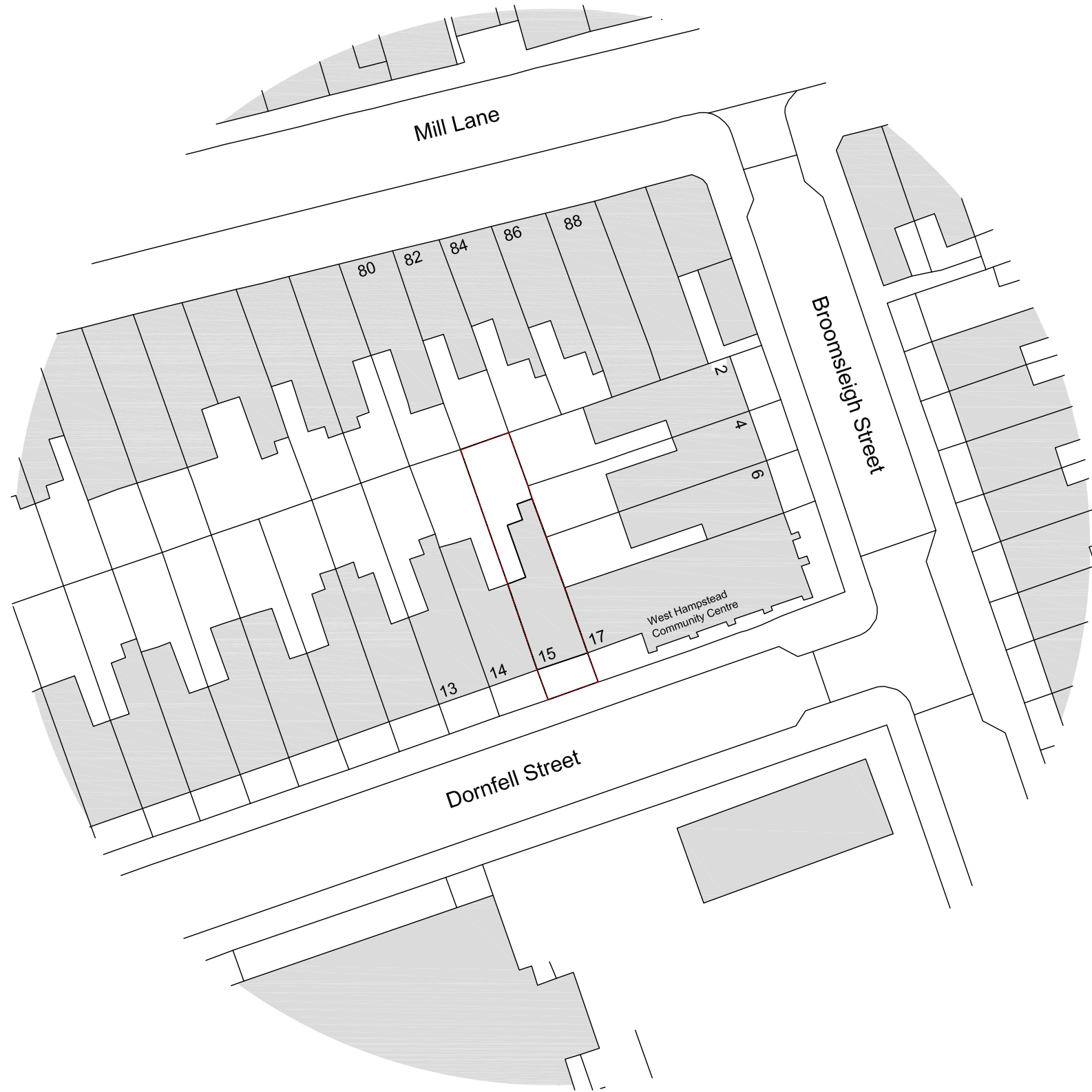
1:500 Block Plan