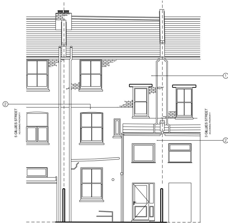
EXISTING SOUTH WEST FACING ELEVATION