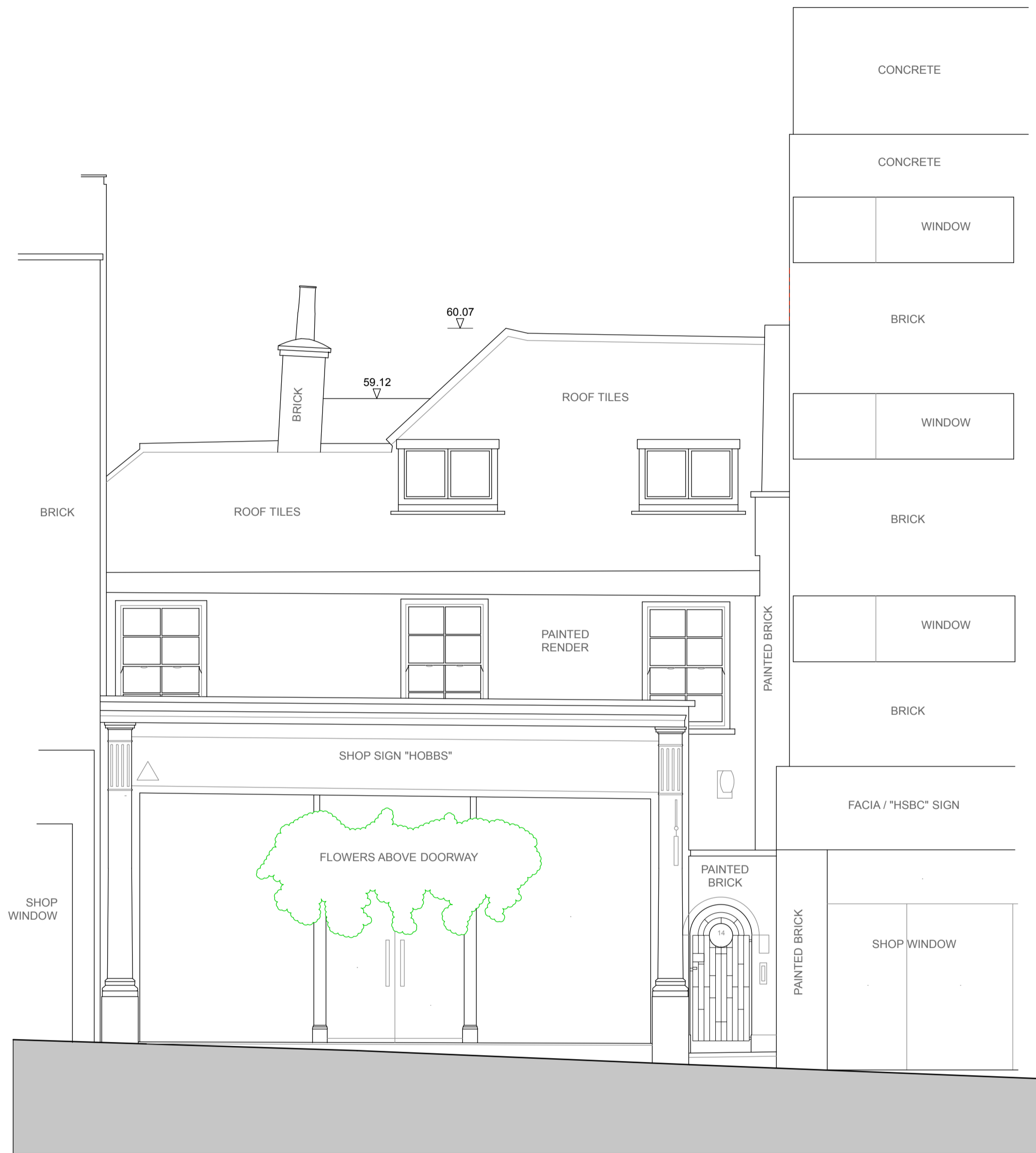
Front/Street Elevation - Existing