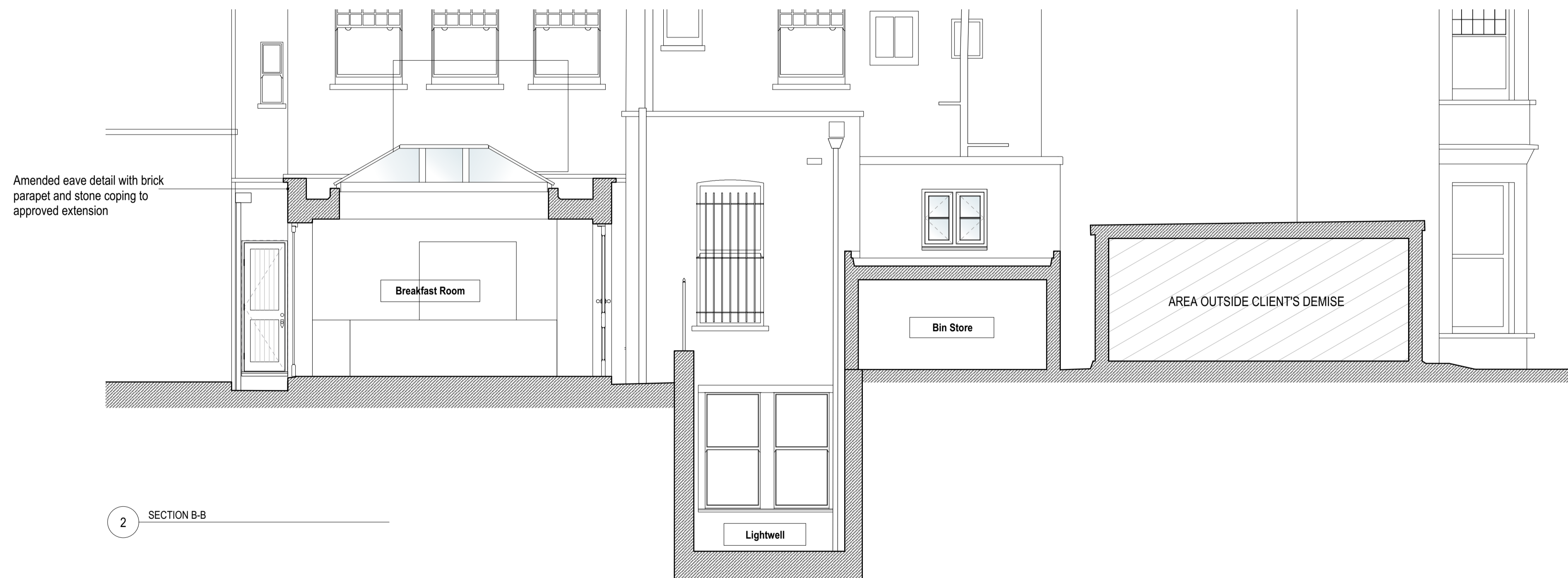
2 SECTION B-B

HATCH INDICATES AREA OUTSIDE THE CLIENT'S DEMISE