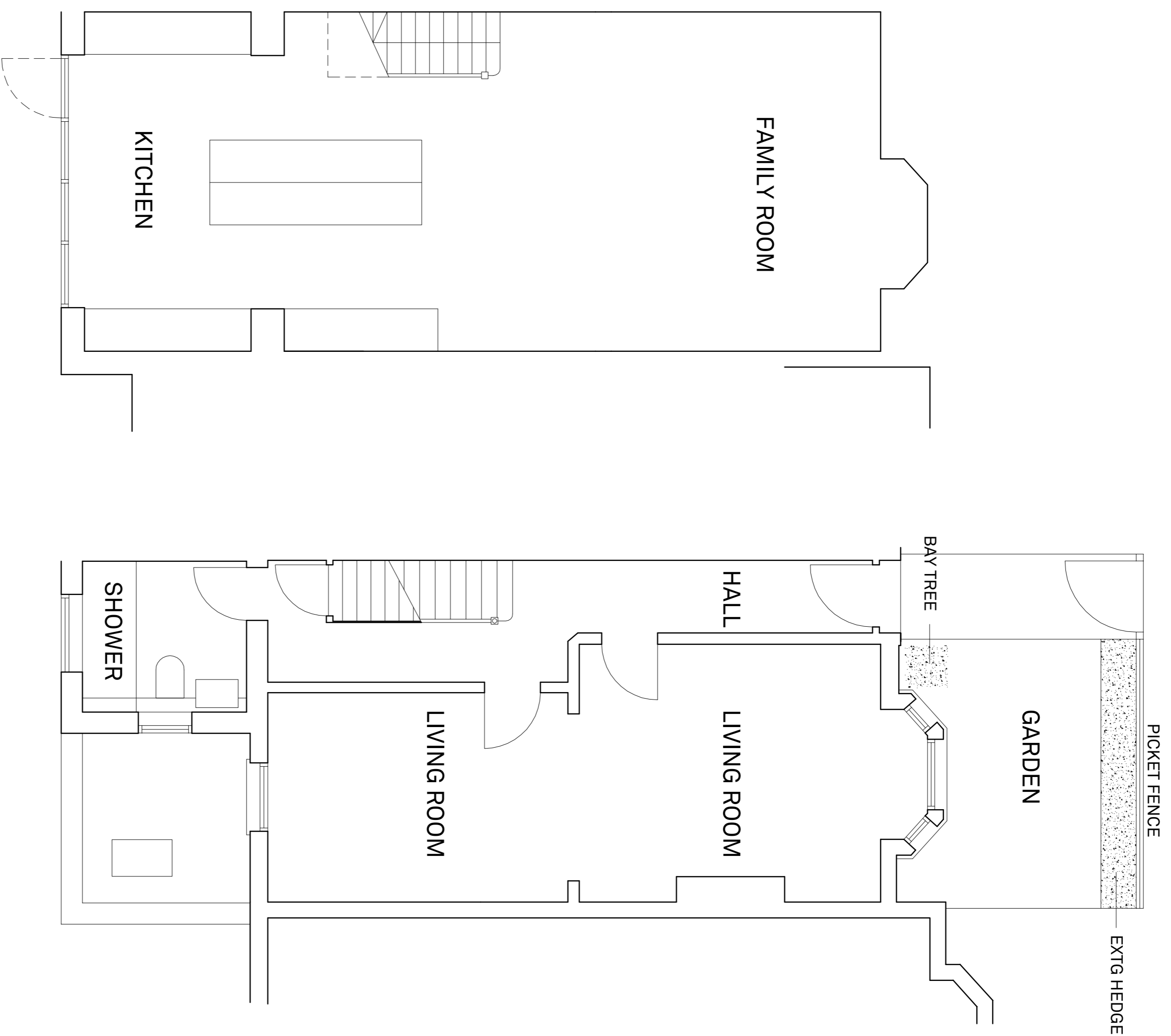
LOWER GROUND FLOOR PLAN AS EXISTS