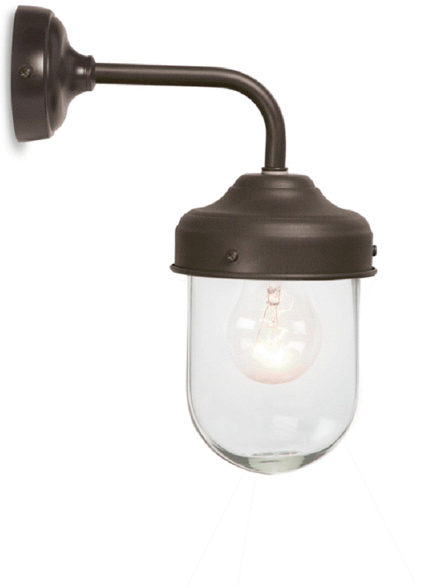
3A PROPOSED EXTERNAL LIGHTS