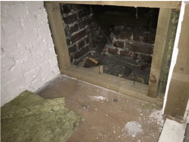
Existing cupboard uncovered to reveal service void below existing roofline and above ceiling void of bathroom below