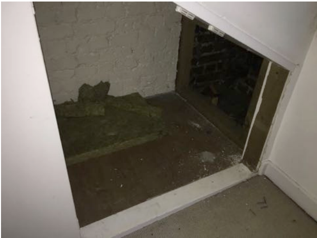
Existing cupboard uncovered to reveal service void below existing roofline and above ceiling void of bathroom below