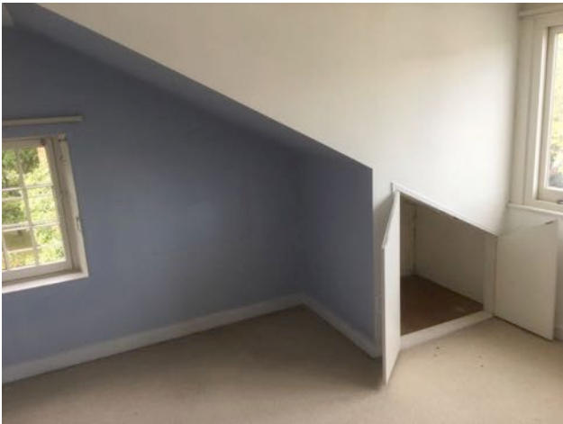
Photographic record of existing cupboard in "bedroom 1" to the rear of the loft floor plan of No. 3 Eton Villas (CUPBOARD A)