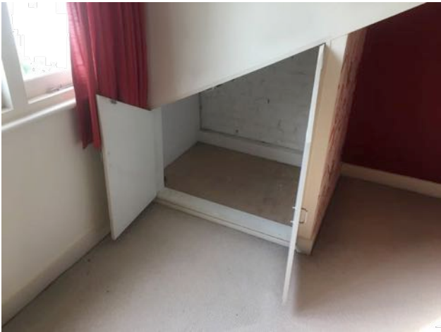
Photographic record of existing cupboard in "bedroom 2" to the front of the loft floor plan of No. 3 Eton Villas (CUPBOARD B)

ALL NEW DRAINAGE FROM LOFT-LEVEL EN-SUITES TO CONNECT TO EXISTING SVP AND VERTICAL DRAINAGE PIPES INSIDE THE BUILDING. (NO EXTERNAL ALTERATIONS ARE REQUIRED TO ACHIEVE THIS). ALL PIPEWORK WILL BE RUN WITHIN TILED / PLASTERBOARDED INTERIOR LINED 'WET-WALLS' AND WITHIN EXISTING ROOF / CEILING VOID *SITE INVESTIGATIONS AND UNCOVERING WORKS HAVE CONFIRMED THAT NO EXISTING JOISTS OR RAFTERS ARE REQUIRED TO BE ALTERED TO ACHIEVE THIS (SEE PICTURES PROVIDED ABOVE)