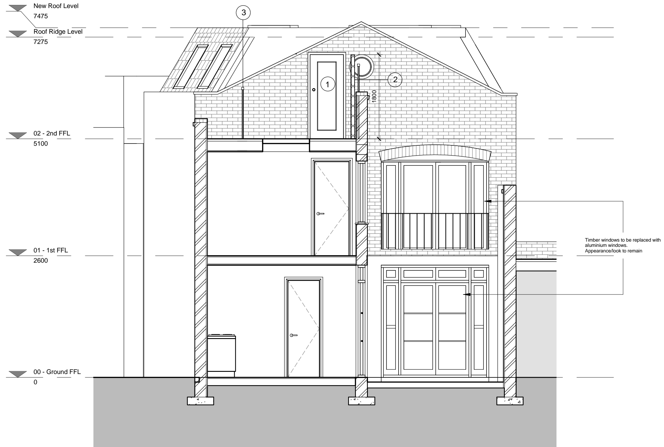
SECTION AA 1:50