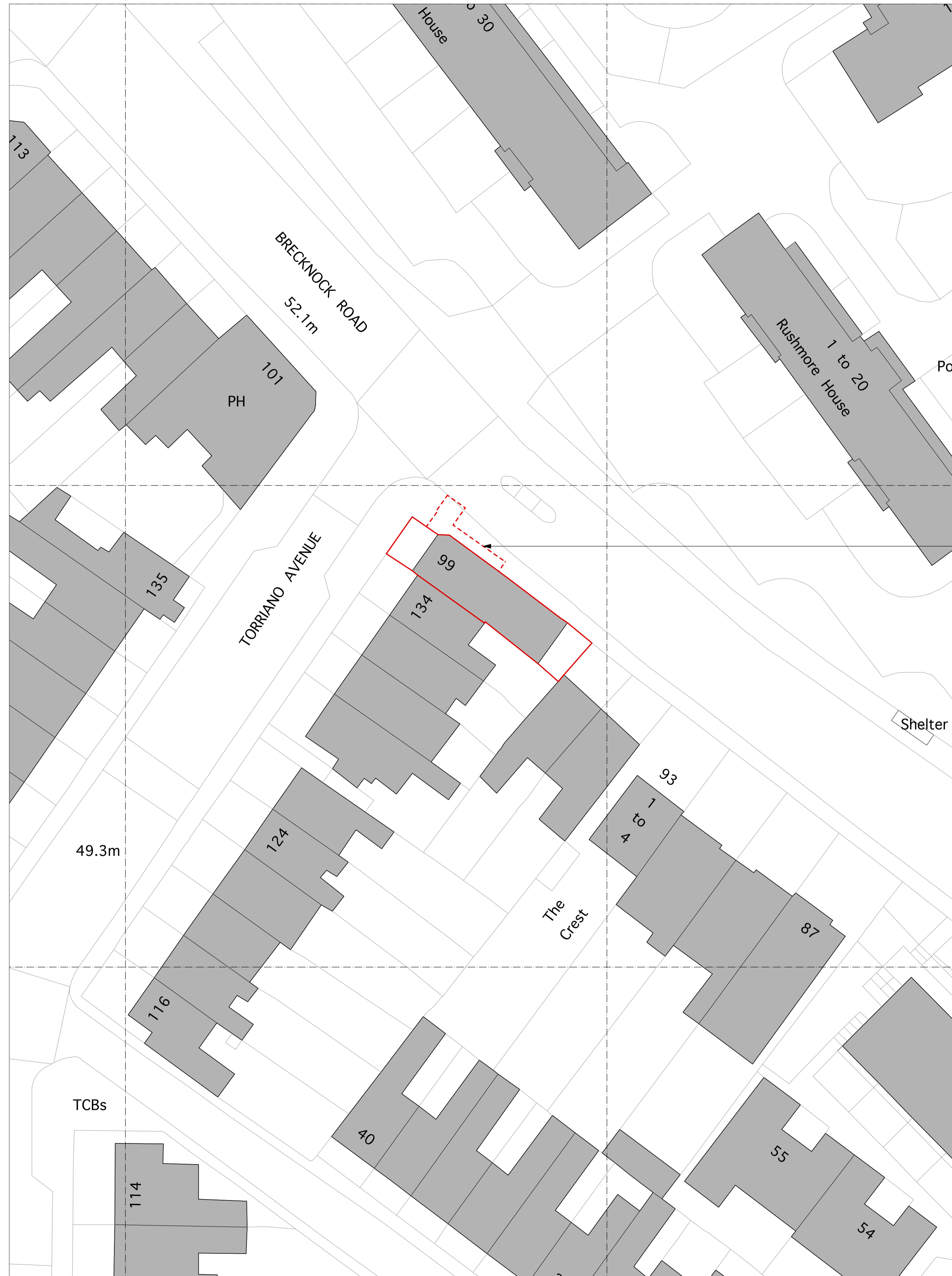
2 Site Plan 1:500 at A3