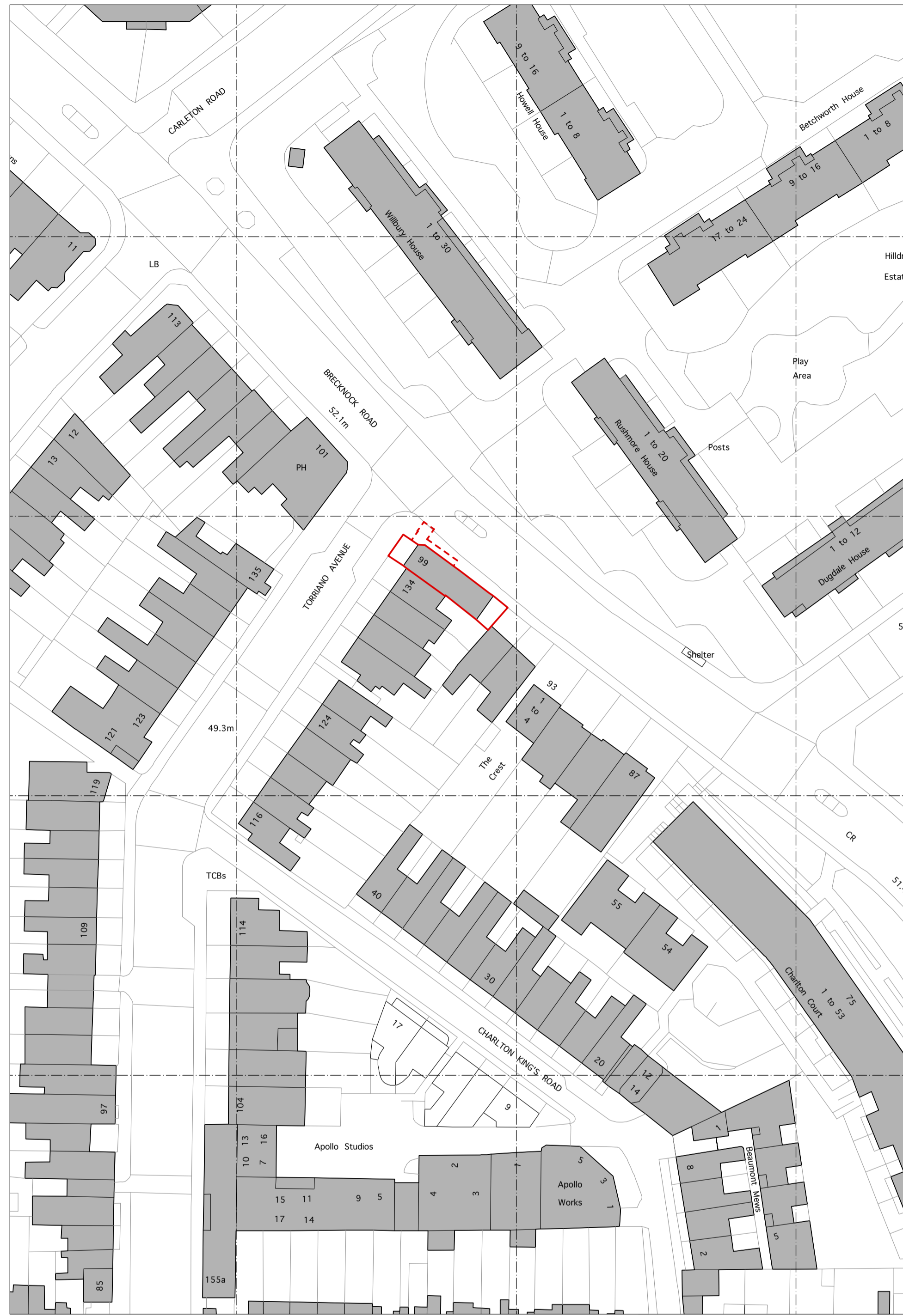
1 Site Location Plan 1:1250 at A3