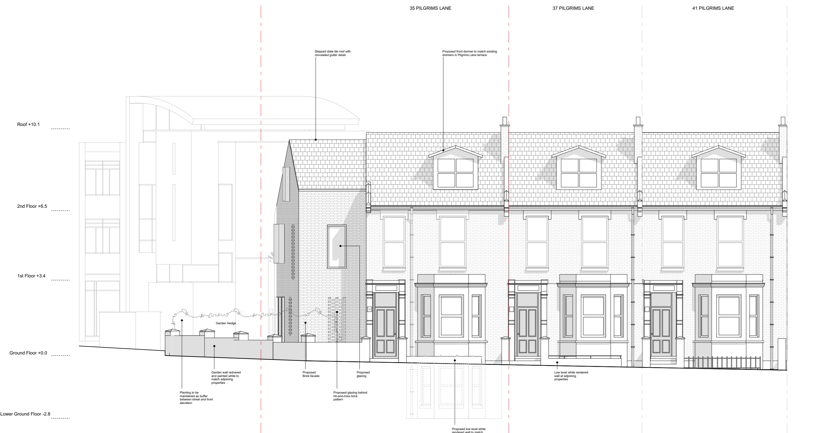
PROPOSED FRONT ELEVATION SCALE 1:100 @A3