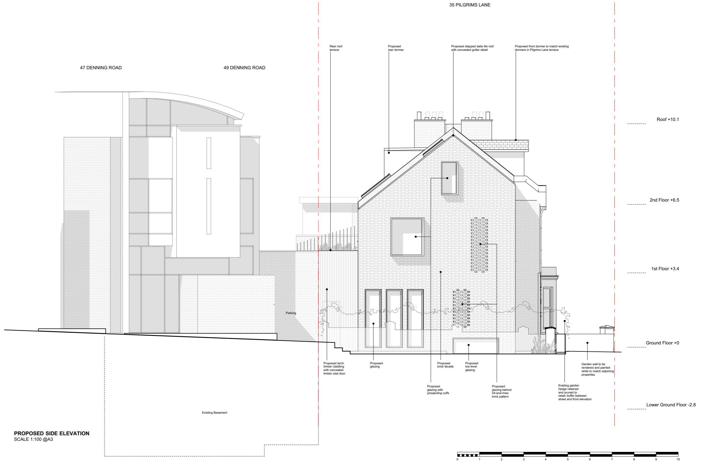
PROPOSED SIDE ELEVATION SCALE 1:100 @A3