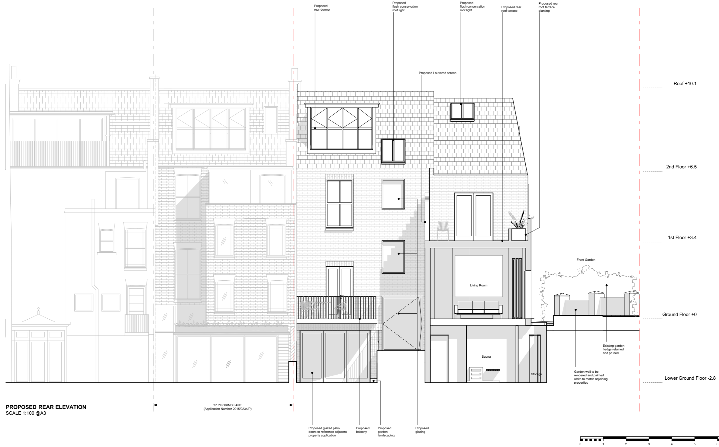
PROPOSED REAR ELEVATION SCALE 1:100 @A3

37 PILGRIMS LANE (Application Number 2015/0234/P)