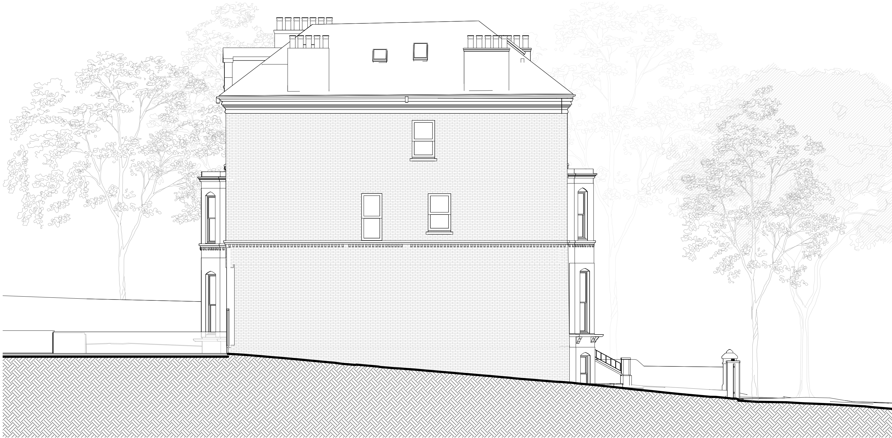
1 Existing South-West Elevation 1:50

General notes: This drawing is copyright of KSR architects. This drawing must be read in conjunction with the Designer's Risk Assessment, specification and all other relevant documentation and drawings. KSR architects accept no liability for any expense, loss or damage of whatsoever nature and however arising from any variation made to this drawing or in the execution of the work to which it relates which has not been referred to them and their approval obtained. Do not scale from this drawing or the digital data, only figured dimensions are to be used. For Planning refer to linear scale. Check all dimensions on site prior to carrying out any works - advise any discrepancy.