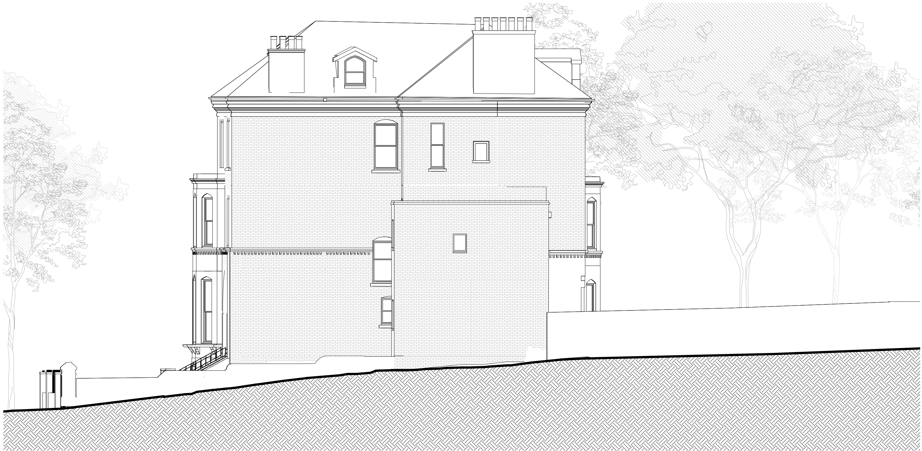
1 Existing North-East Elevation 1:50

General notes: This drawing is copyright of KSR architects. This drawing must be read in conjunction with the Designer's Risk Assessment, specification and all other relevant documentation and drawings. KSR architects accept no liability for any expense, loss or damage of whatsoever nature and however arising from any variation made to this drawing or in the execution of the work to which it relates which has not been referred to them and their approval obtained. Do not scale from this drawing or the digital data, only figured dimensions are to be used. For Planning refer to linear scale. Check all dimensions on site prior to carrying out any works - advise any discrepancy.