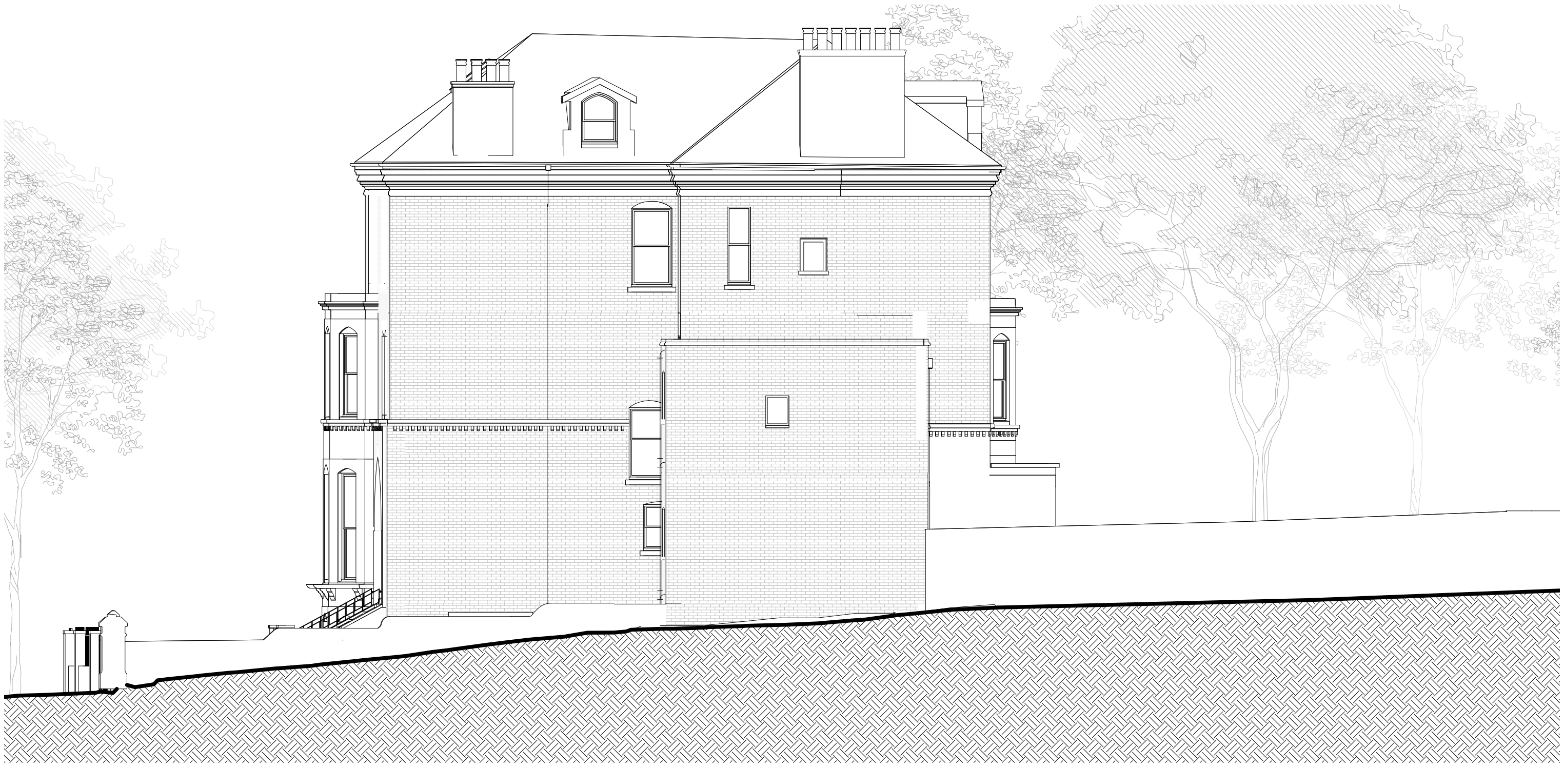
1 Proposed North-East Elevation 1:50

General notes: This drawing is copyright of KSR architects. This drawing must be read in conjunction with the Designer's Risk Assessment, specification and all other relevant documentation and drawings. KSR architects accept no liability for any expense, loss or damage of whatsoever nature and however arising from any variation made to this drawing or in the execution of the work to which it relates which has not been referred to them and their approval obtained. Do not scale from this drawing or the digital data, only figured dimensions are to be used. For Planning refer to linear scale. Check all dimensions on site prior to carrying out any works - advise any discrepancy.