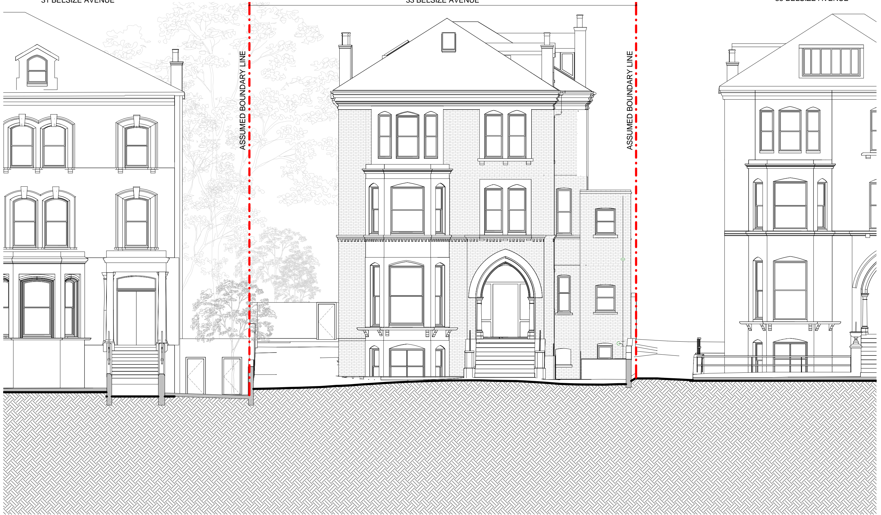
1 Proposed Front Elevation 1:50

General notes: This drawing is copyright of KSR architects. This drawing must be read in conjunction with the Designer's Risk Assessment, specification and all other relevant documentation and drawings. KSR architects accept no liability for any expense, loss or damage of whatsoever nature and however arising from any variation made to this drawing or in the execution of the work to which it relates which has not been referred to them and their approval obtained. Do not scale from this drawing or the digital data, only figured dimensions are to be used. For Planning refer to linear scale. Check all dimensions on site prior to carrying out any works - advise any discrepancy.