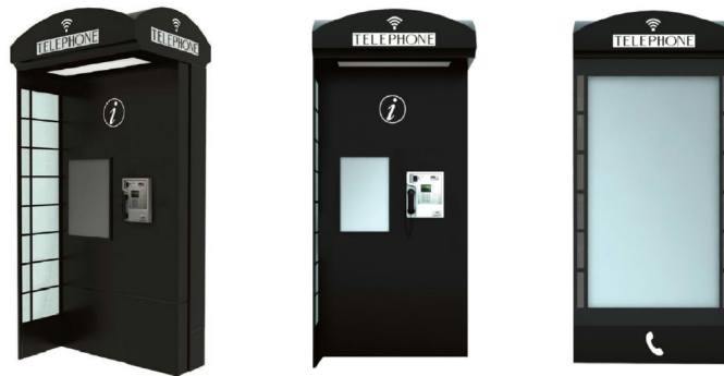
Proposed replacement Telephone Kiosk

23. ... I am satisfied the proposed kiosk would perform a public function”.