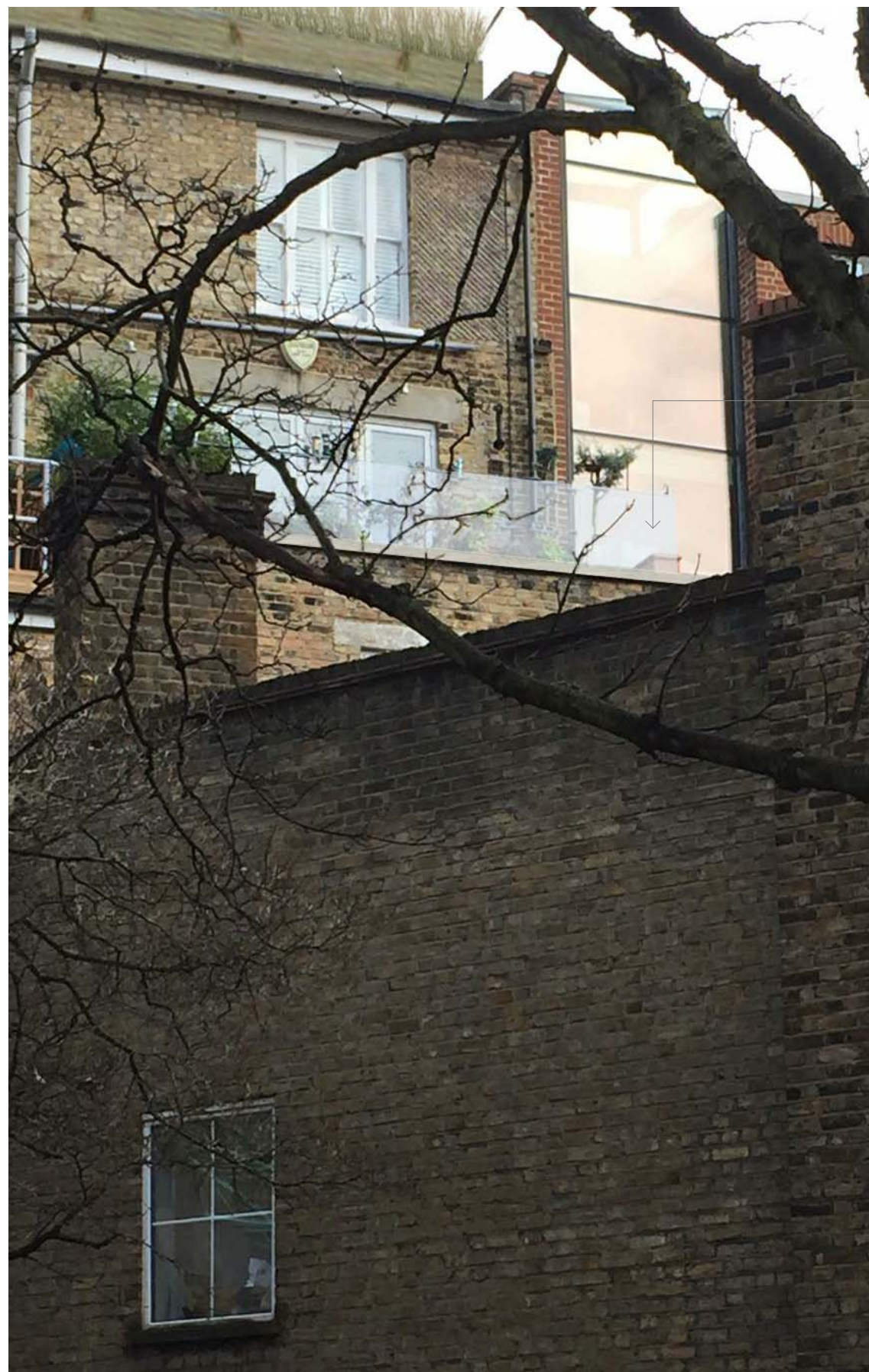
Proposed view from Lamb's Conduit Passage