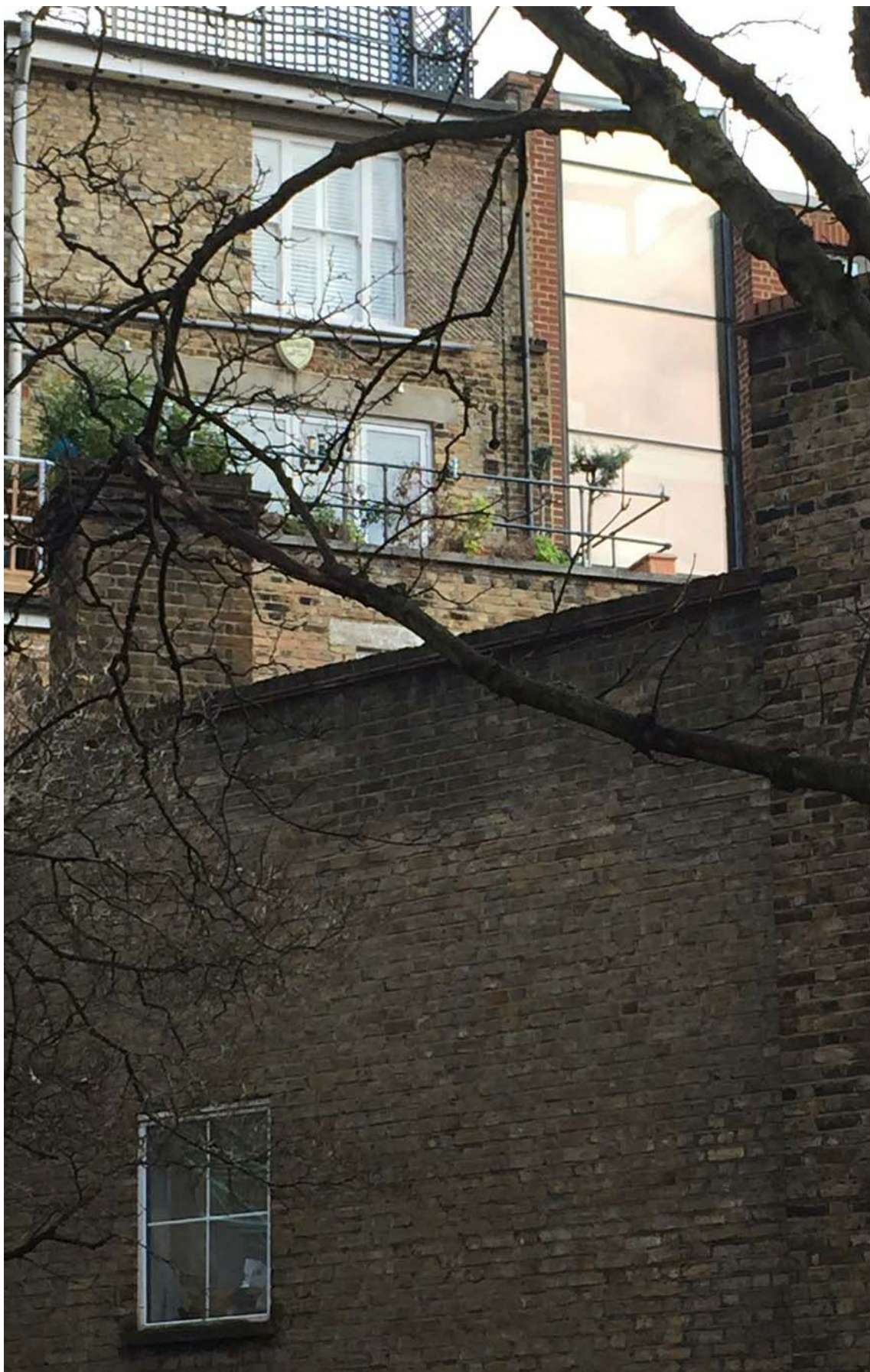
Existing view from Lamb's Conduit Passage