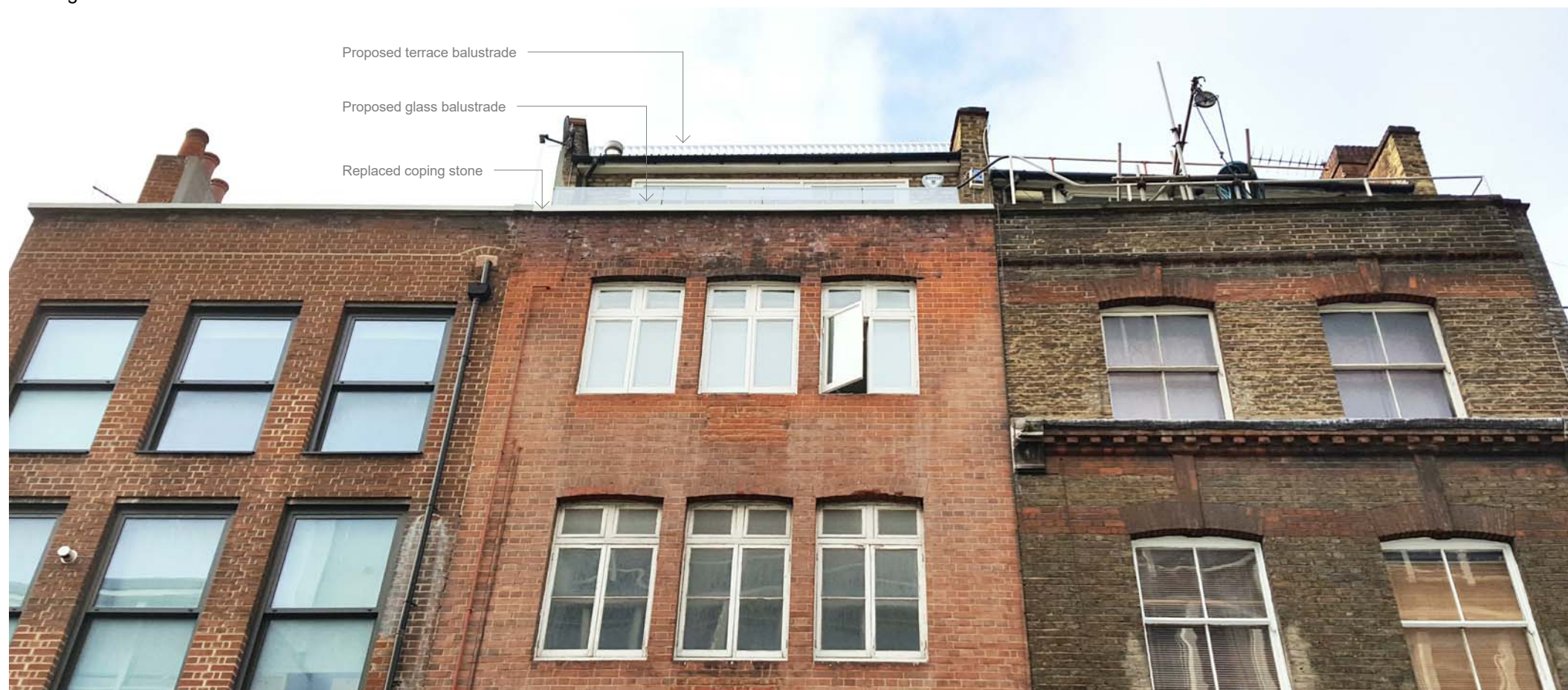
Proposed view from Red Lion St.