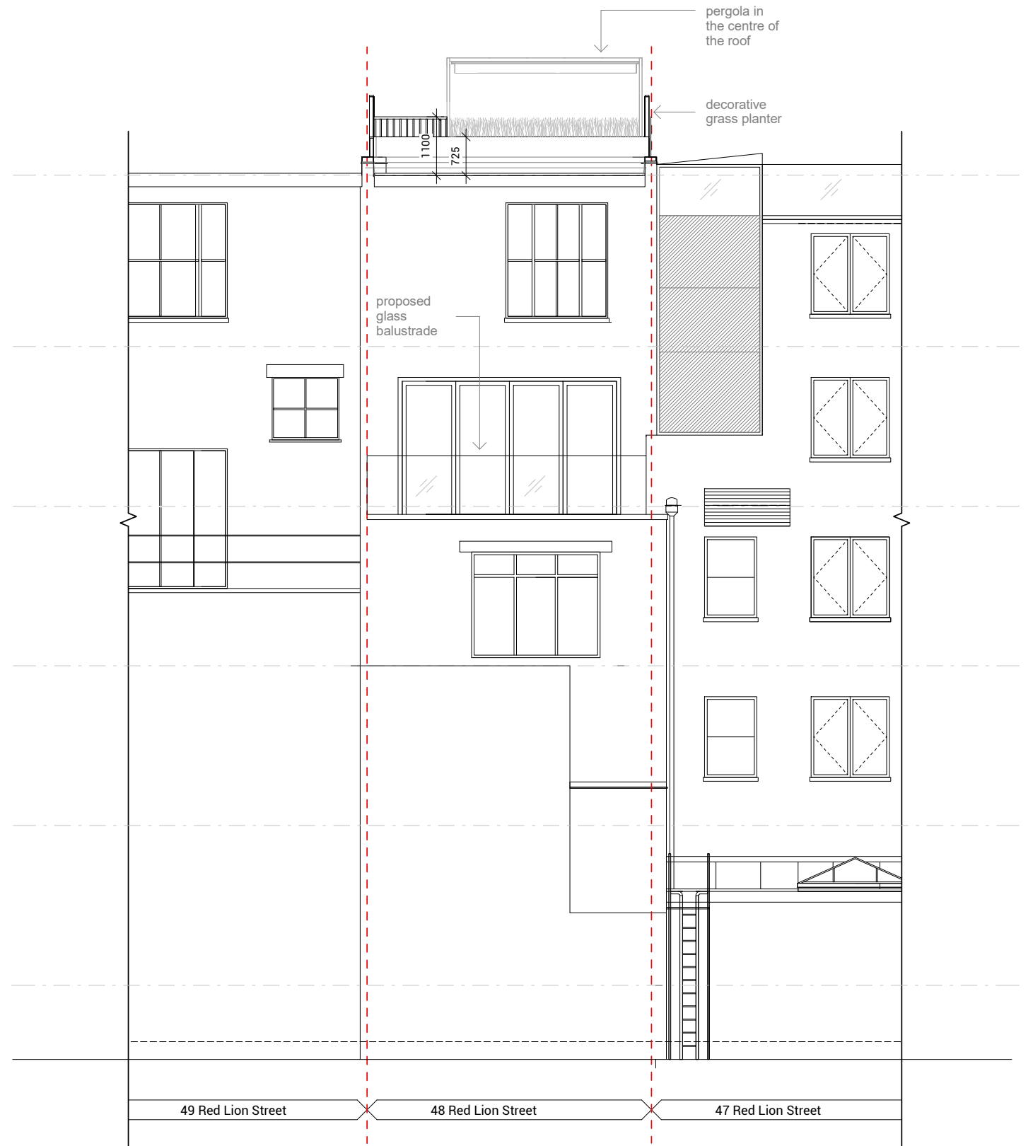
2 Proposed Rear Elevation 222-002 1 : 100