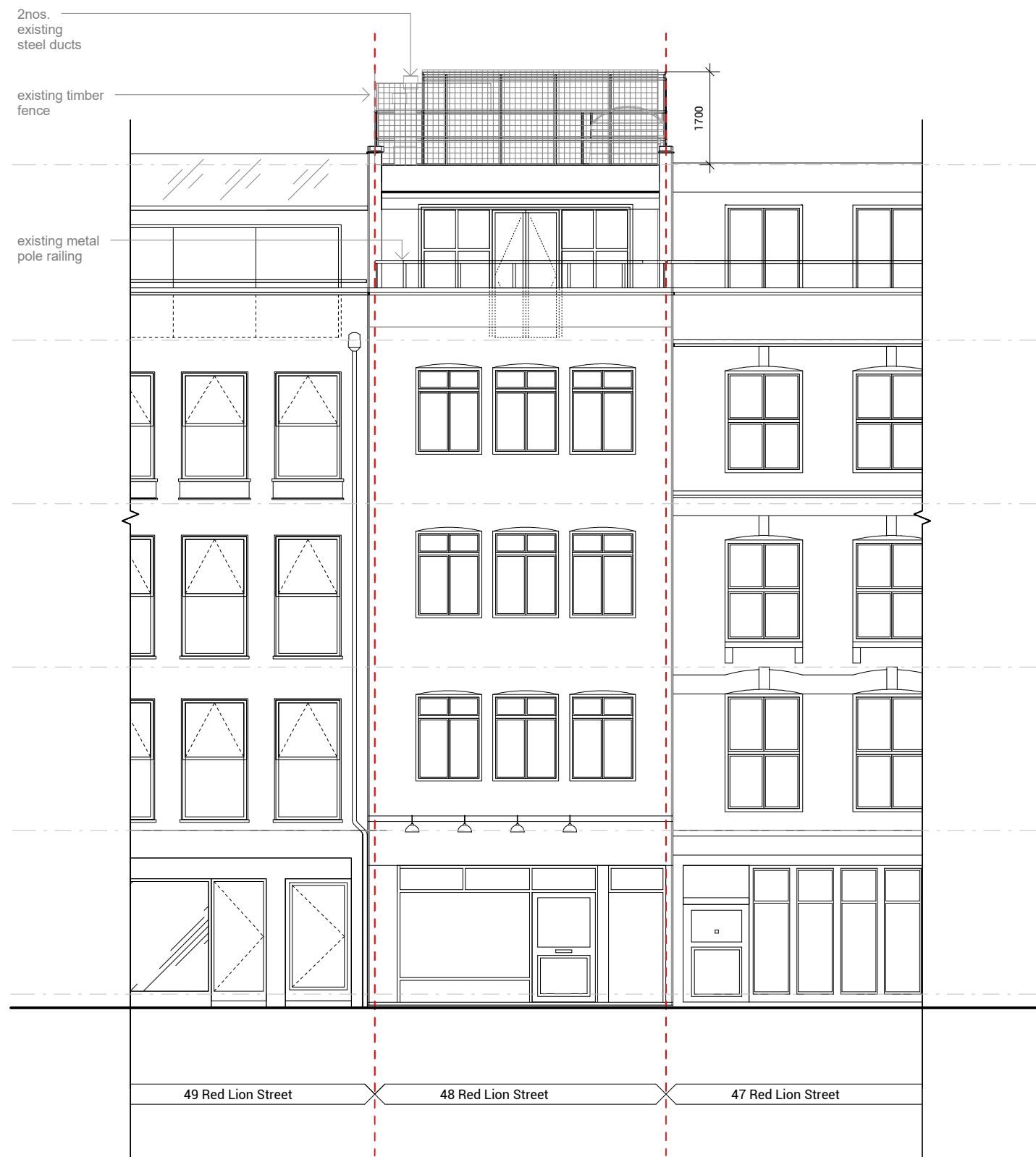
1 Existing Street Elevation 222-001 1 : 100