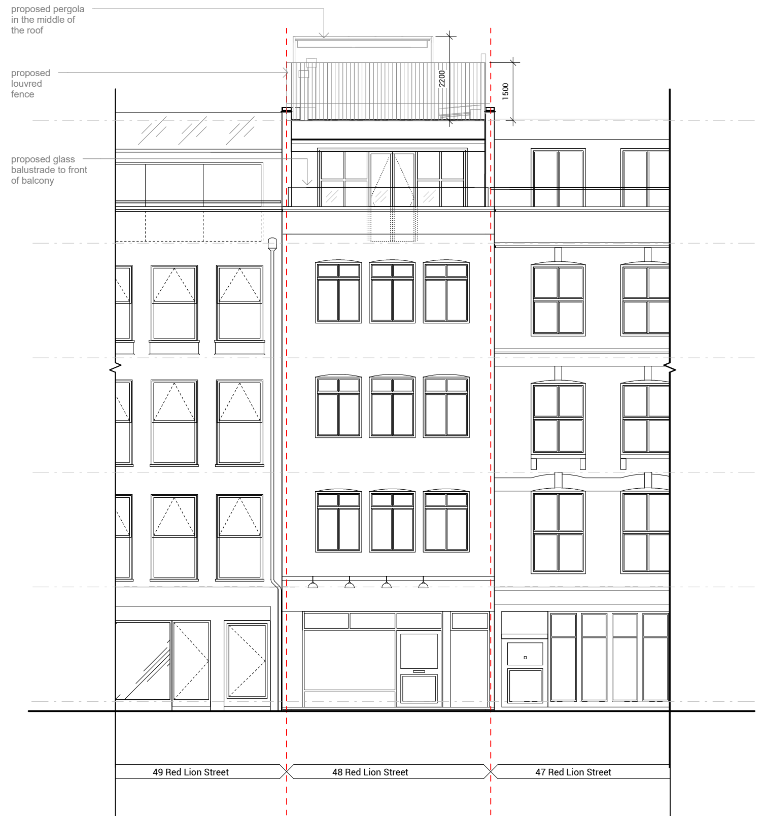
2 Proposed Street Elevation 222-001 1 : 100