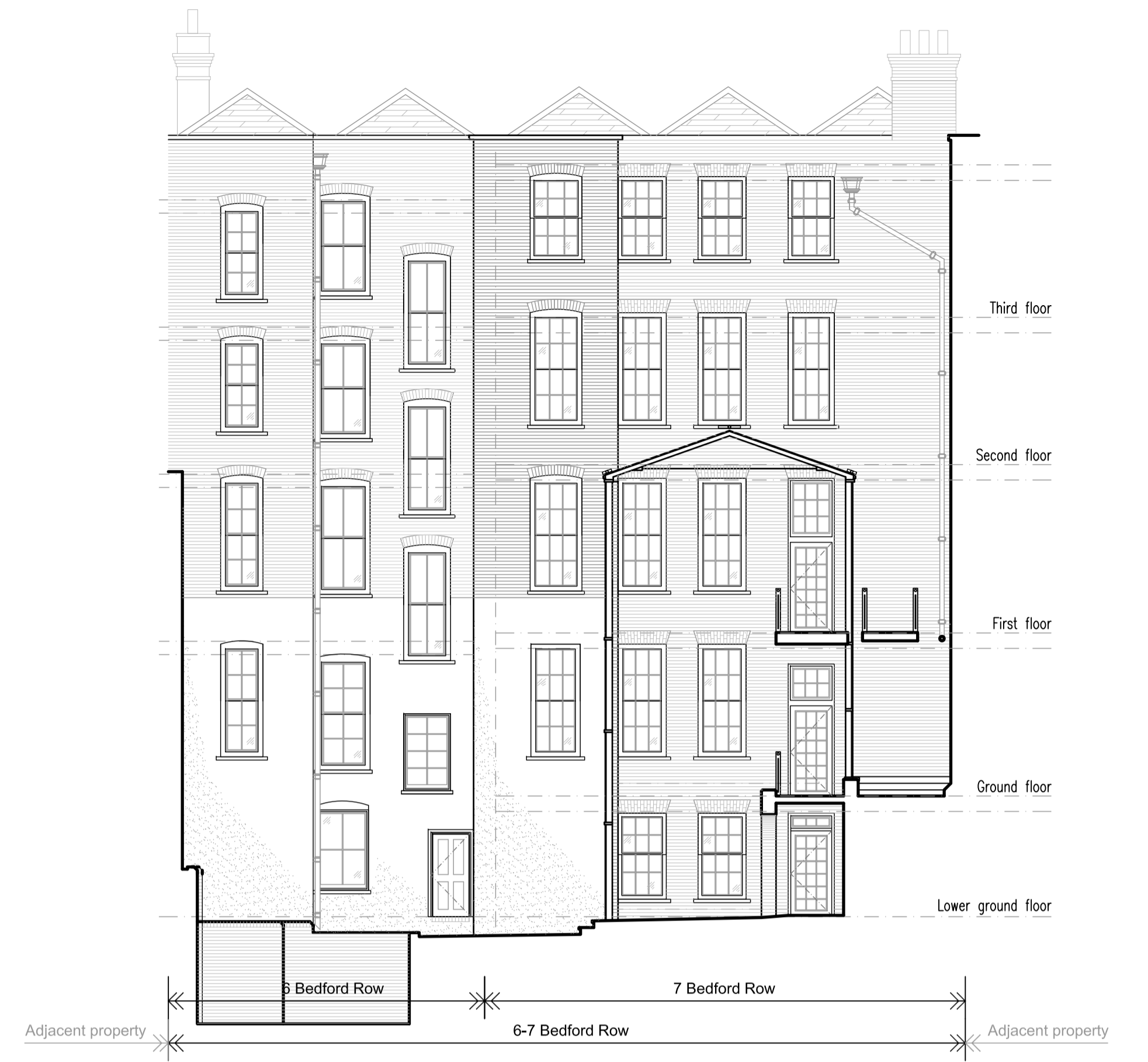
3 Internal courtyard - Elevation Scale 1:100