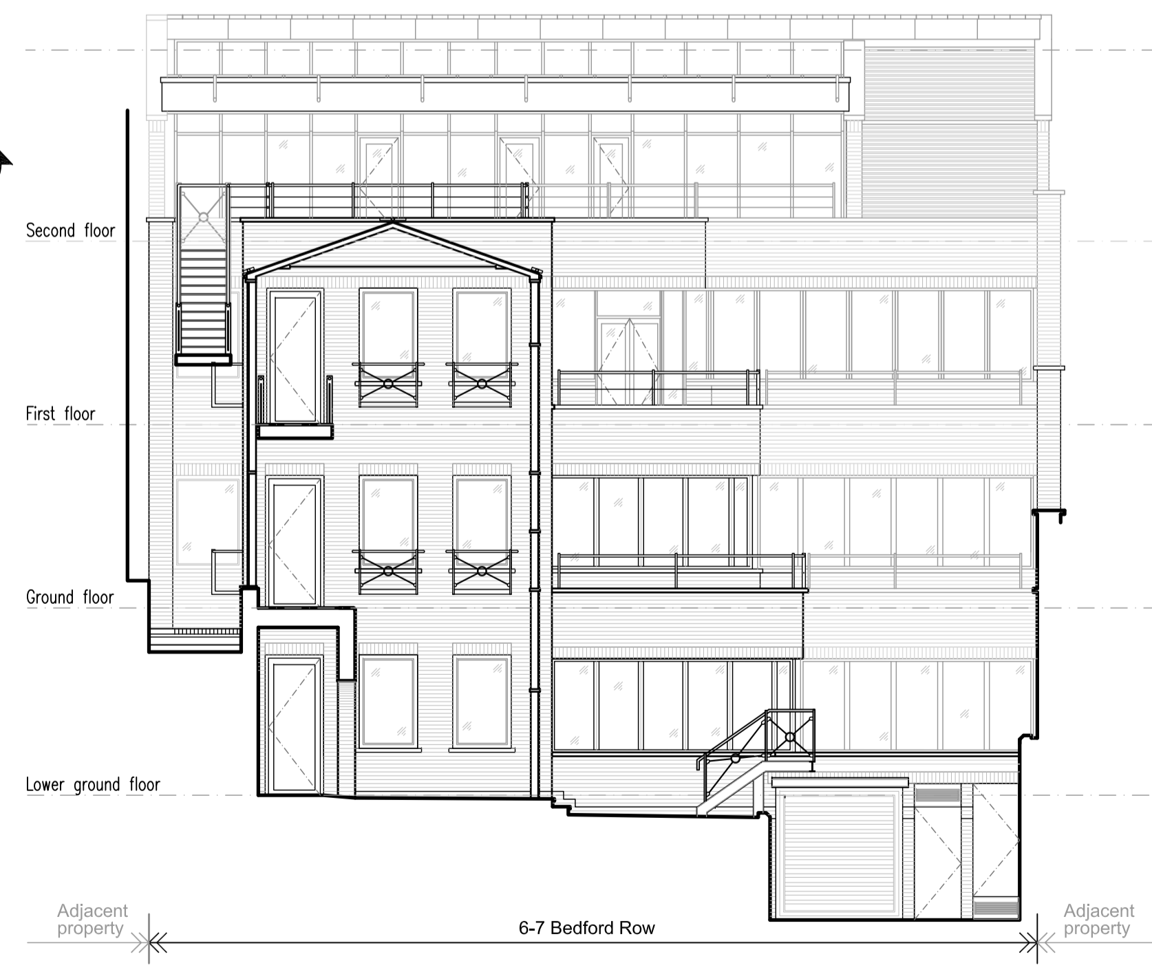
4 Courtyard - Elevation Scale 1:100

LC Issued to local Authority for Listed Building Consent. 23.02.18 Rev. | Drawn | Description | Date