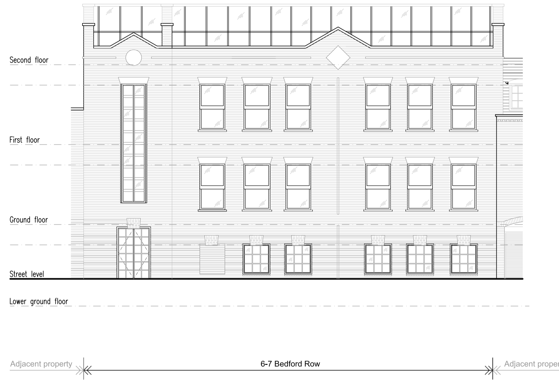
2 Jockey Fields - Elevation Scale 1:100