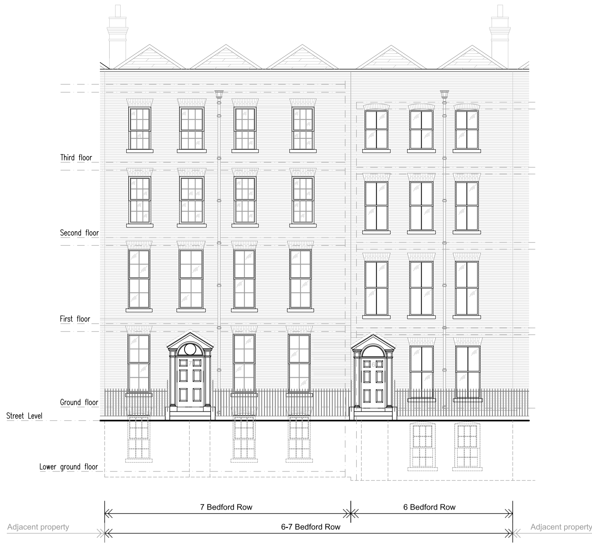
1 Bedford Row - Elevation Scale 1:100