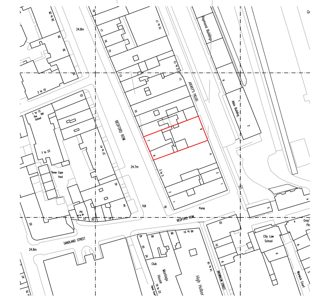
Ordnance survey map Scale 1:1250

LC Issued to local Authority for Listed Building Consent. 23.02.18 Rev. | Drawn | Description | Date