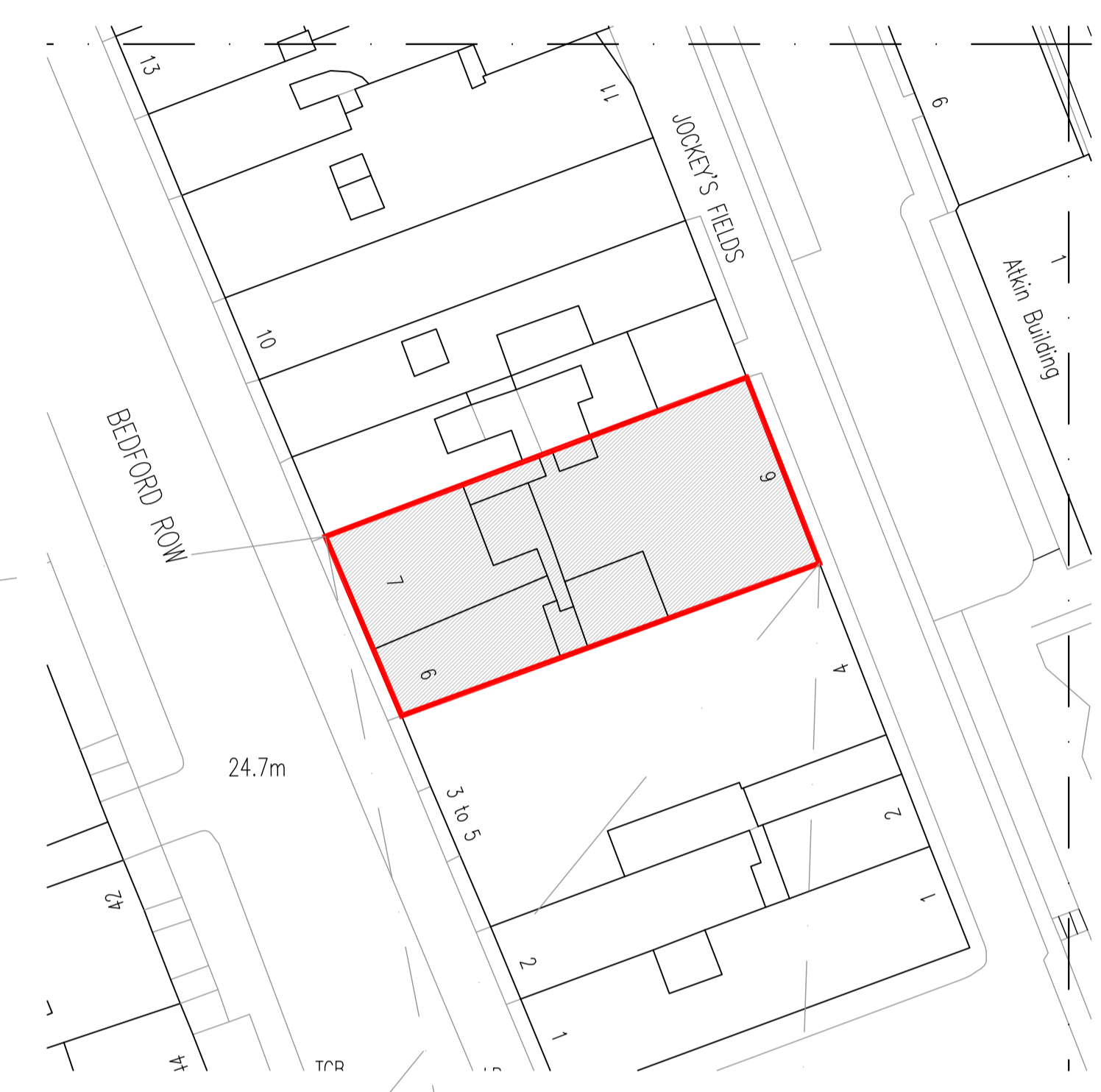
Block plan Scale 1:1500

DRAWING LEGEND EXPOSURES REQUIRED TO THE BUILDING FABRIC ARE REQUIRED AS PART OF A STRUCTURAL INVESTIGATION INTO THE PROPERTY TO IDENTIFY THE CAUSES FOR CRACKS AND SETTLEMENT OCCURRING. ☒ DENOTES LOCATION WHERE EXPOSURE OF THE STRUCTURE IS REQUIRED IN EITHER THE FLOOR OR CEILING. APERTURES TO BE 600 x 600 mm MINIMUM. --- DENOTES LOCATION WHERE EXPOSURE OF THE STRUCTURE IS REQUIRED TO A WALL OR SURFACE. MINIMUM AREA 600 x 600 mm PLASTER TO BE REMOVED AROUND CRACK. ② * NUMBER REFERS TO LOCATION, DETAILS CAN BE FOUND IN THE PROPOSED HERITAGE STATEMENT.