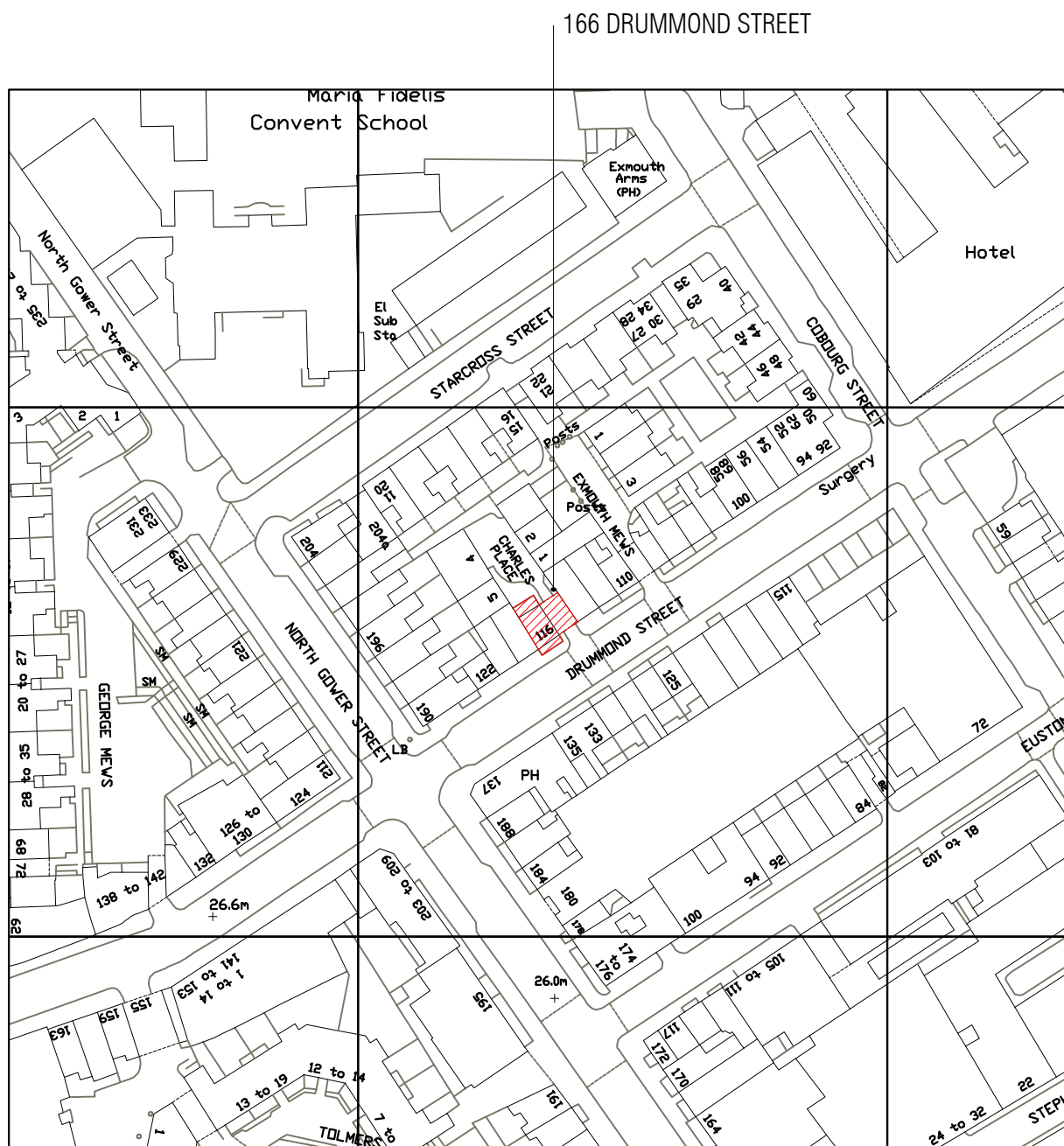
01 EXISTING LOCATION PLAN scale 1:1250