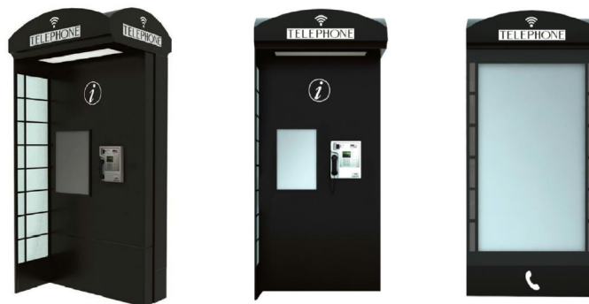
Proposed replacement Telephone Kiosk

23. ... I am satisfied the proposed kiosk would perform a public function”.