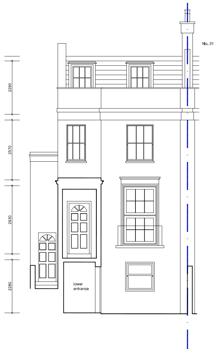
front elevation through well as proposed