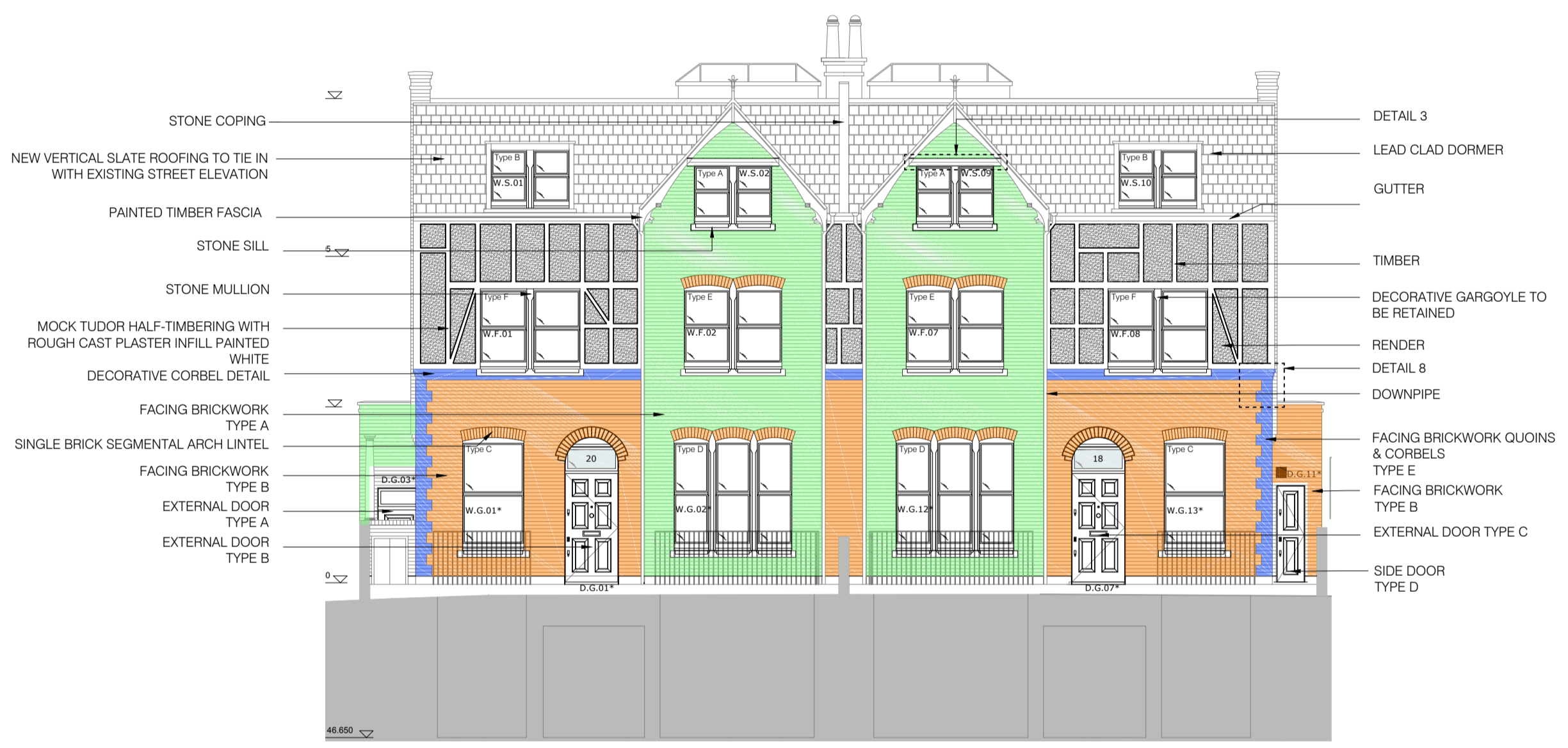
Front Elevation (A) Scale 1:100

This contract shall be read in conjunction with the contract documents and the contract documents shall prevail in the event of any discrepancy. The contractor shall be responsible for obtaining all necessary planning and building regulations approvals. The contractor shall be responsible for obtaining all necessary planning and building regulations approvals. The contractor shall be responsible for obtaining all necessary planning and building regulations approvals.