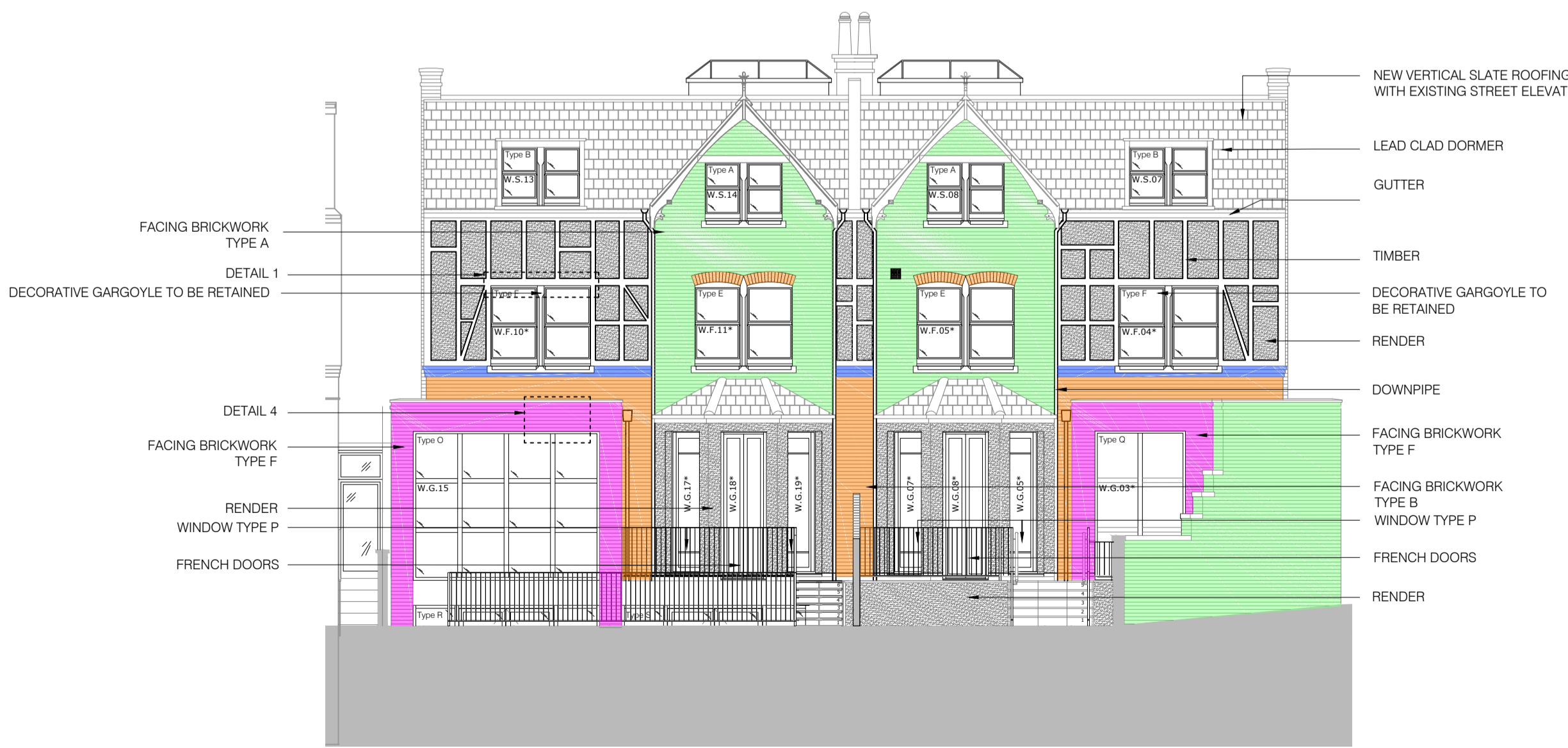
Rear Elevation (C) Scale 1:100