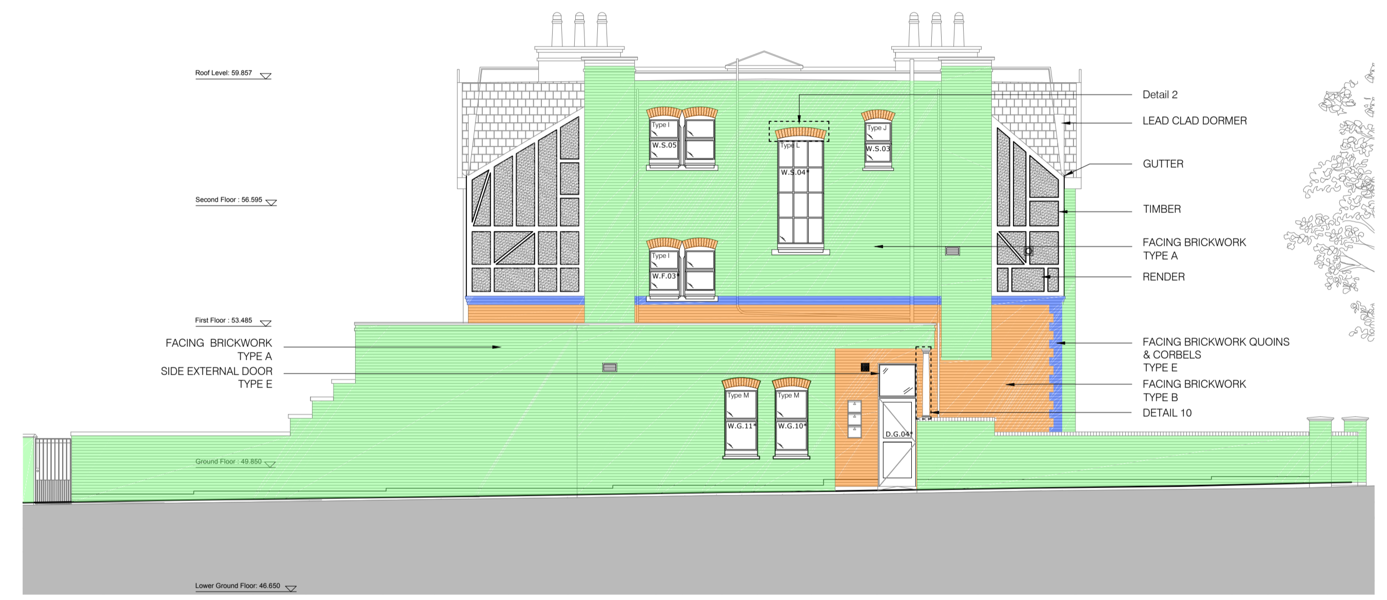
West Side Elevation (B) Scale 1:100